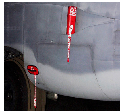
C-130 Heat Exchanger & Exhaust Plugs