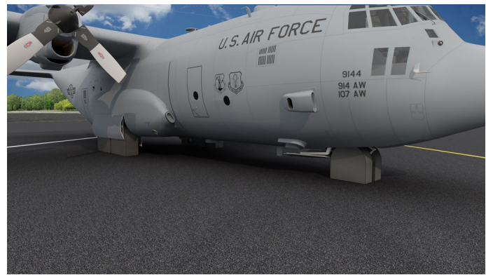
C-130 Tire Covers