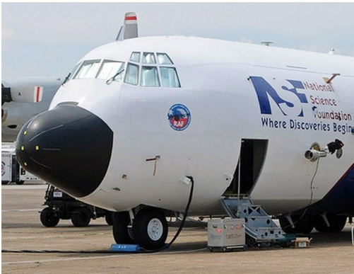
Lockheed C-130 Flight Deck HeatShield Set