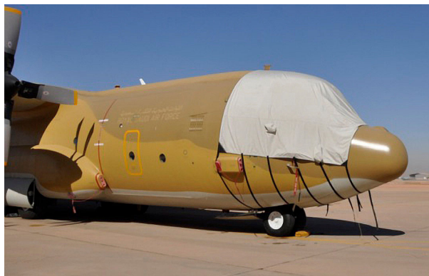
C-130 Cockpit Cover (Windshield/Flight Deck)

This cover type is made from Silver Acrylic Sunbrella canvas and is 100% lined with a soft and smooth microfiber. Bruce's Custom Covers developed this material combination especially for aircraft protection. The outer material is medium weight and treated for water resistance, UV resistance and anti-static buildup. The inner lining is a very soft and smooth microfiber to prevent scratching. The material is very reflective, and tests show that the cabin interior temperature can be reduced to near-ambient temperature on the hottest of days. It is water, ice and snow repellent, yet breathable to allow moisture to escape from between the cover and the aircraft surface.