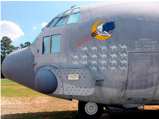
Lockheed AC-130A Flight Deck HeatShield Set

Windshield and Skylight Heatshields are interior sunshades for an aircraft's front windshield and overhead window. The product is a unique composite of closed-cell foam with a silver mylar finish. The semi-rigid design is stiff enough to stand along the inside of the windshield using sun visors or window framing. It folds up flat and easily stores in the included storage sleeve. Some designs may require velcro and suction cups or split right and left sides. A Heatshield is an excellent short-term remedy for cockpit overheating. An external fabric cover is far more effective and practical for long-term protection.