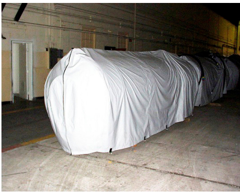
C-130 Aux. Fuel Tank Covers

ALL-YEAR USE MATERIAL - Made with Silver Acrylic Sunbrella canvas, the all-year use material is the best option for sun protection and cover longevity. This heavier more durable material is intended for all weather conditions, such as rain and snow or lots of sun.