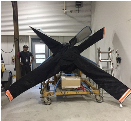
C-130 Propellor/Spinner Cover