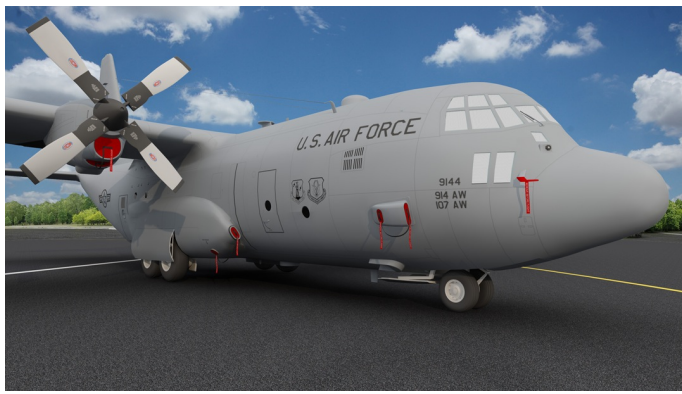
C-130 Engine Plugs (illustration)