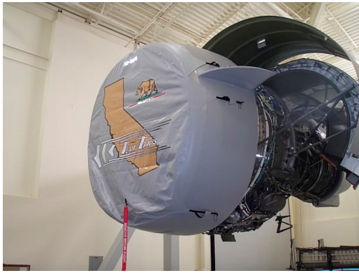
C-17 Engine Intake Cover with Custom Artwork