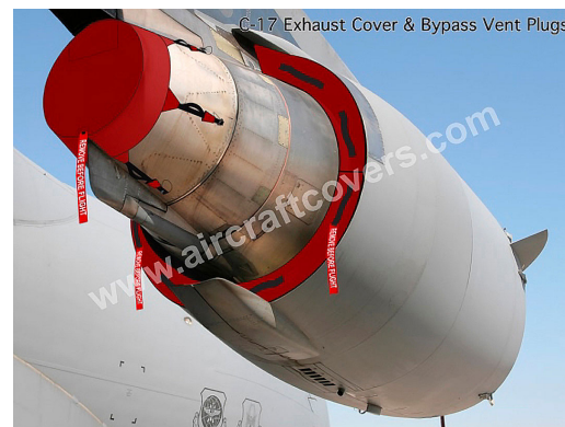
C-17 Globemaster Exhaust Cover and Bypass Vent Plugs, folding type