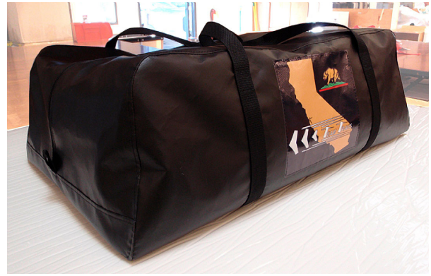
Storage Bag for the Intake Cover Set