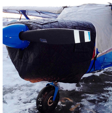
Cessna 205 Insulated Engine Cover