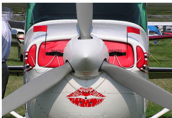
Cessna Turbo U206F Engine Inlet Plugs

Engine Inlet Plugs are custom fit for your Cessna 205 Stationair intakes, made with heavy-duty vinyl material, and stuffed with a single block of sculpted urethane foam. Each plug has a zipper that allows the foam to be removed and dried if necessary. Engine plugs have warning flags that are visible from the cockpit or 'remove before flight' streamers sewn onto the face of the plugs. Most plugs are imprinted with the aircraft registration number in black for an extra charge. Storage bag NOT included. Engine plugs may be inserted after flight when the engine is still warm. Engine Inlet Plugs are commonly referred to as Cowl Plugs, Intake Plugs, Cowl Blocks, Engine Blocks, and Engine Bungs.