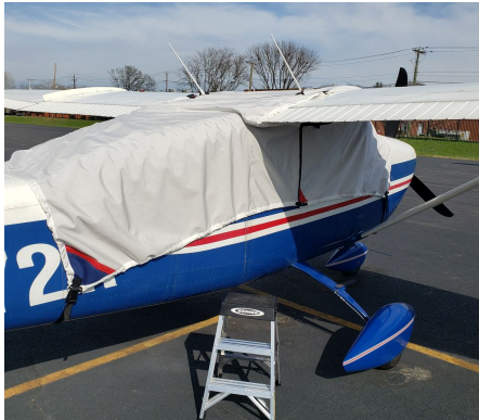
Cessna 205 Over The Top Style Canopy Cover