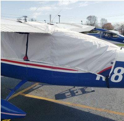
Cessna 205 Over The Top Style Canopy Cover

This cover type is made from Silver Acrylic Sunbrella canvas and is 100% lined with a soft and smooth microfiber. Bruce's Custom Covers developed this material combination especially for aircraft protection. The outer material is medium weight and treated for water resistance, UV resistance and anti-static buildup. The inner lining is a very soft and smooth microfiber to prevent scratching. The material is very reflective, and tests show that the cabin interior temperature can be reduced to near-ambient temperature on the hottest of days. It is water, ice and snow repellent, yet breathable to allow moisture to escape from between the cover and the aircraft surface.