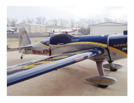
Extra 300SC with NASCAR style custom cover

The Mudry Cap 231 & 232 Canopy/Engine Cover is a one-piece cover (100% lined with microfiber) that is a combination of the Canopy Cover and Engine Cover. This cover will enclose the engine cowl and will extend aft to cover all of the windows. This cover type is made from Silver Acrylic Sunbrella canvas and is 100% lined with a soft and smooth microfiber. Bruce's Custom Covers developed this material combination especially for aircraft protection. The outer material is medium weight and treated for water resistance, UV resistance and anti-static buildup. The inner lining is a very soft and smooth microfiber to prevent scratching. The material is very reflective, and tests show that the cabin interior temperature can be reduced to near-ambient temperature on the hottest of days. It is water, ice and snow repellent, yet breathable to allow moisture to escape from between the cover and the aircraft surface.