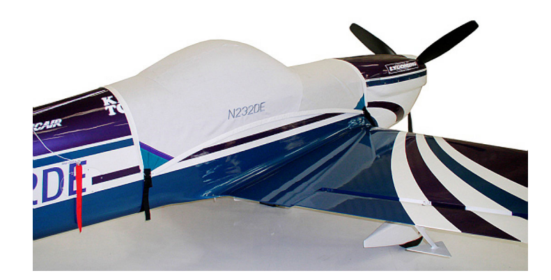
Cap 232 Canopy Cover