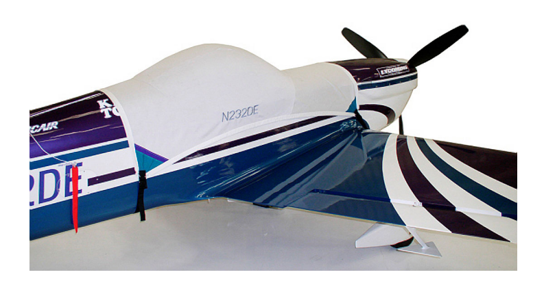
Cap 232 Canopy Cover