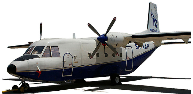
Casa 212 Engine Plugs