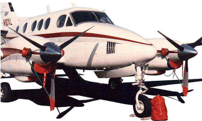
Pitot, Exhaust Covers, Engine Plugs & Prop Ties

Engine Inlet Plugs are custom fit for your Casa/IPTN CN-235 intakes, made with heavy-duty vinyl material, and stuffed with a single block of sculpted urethane foam. Each plug has a zipper that allows the foam to be removed and dried if necessary. Engine plugs have warning flags that are visible from the cockpit or 'remove before flight' streamers sewn onto the face of the plugs. Most plugs are imprinted with the aircraft registration number in black for an extra charge. Storage bag NOT included. Engine plugs may be inserted after flight when the engine is still warm. Engine Inlet Plugs are commonly referred to as Cowl Plugs, Intake Plugs, Cowl Blocks, Engine Blocks, and Engine Bungs.