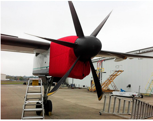
Dash 8-Q400 Insulated Engine Cover