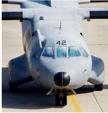
Casa C-295 Cockpit HeatShields (illustration)

for cockpit overheating, but an external fabric cover is more effective for long-term protection.