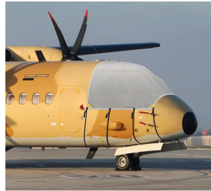
Casa C-295 Cockpit Cover (illustration)