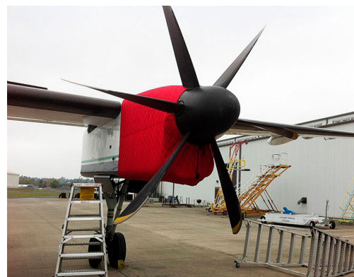
Dash 8-Q400 Insulated Engine Cover