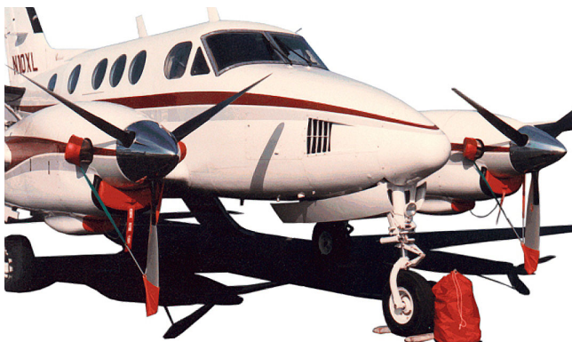
Pitot, Exhaust Covers, Engine Plugs & Prop Ties

Engine Inlet Plugs are custom fit for your Casa EADS C-295 intakes, made with heavy-duty vinyl material, and stuffed with a single block of sculpted urethane foam. Each plug has a zipper that allows the foam to be removed and dried if necessary. Engine plugs have warning flags that are visible from the cockpit or 'remove before flight' streamers sewn onto the face of the plugs. Most plugs are imprinted with the aircraft registration number in black for an extra charge. Storage bag NOT included. Engine plugs may be inserted after flight when the engine is still warm. Engine Inlet Plugs are commonly referred to as Cowl Plugs, Intake Plugs, Cowl Blocks, Engine Blocks, and Engine Bungs.