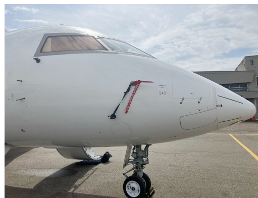
Challenger 650 Pitot & Ice Detector Covers