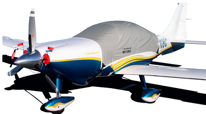
Cessna 350/400 Canopy Cover & Engine Plugs