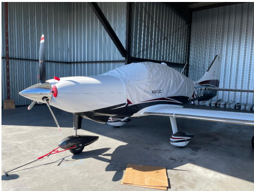
Textron T240 Canopy Cover