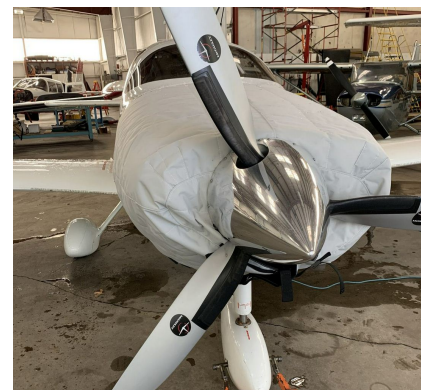
Cessna Corvallis Insulated Engine Cover