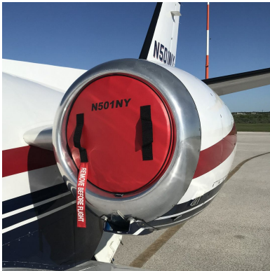
Citation 501 Intake/Exhaust Plug Set