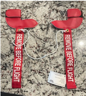
Cessna Citation Pitot Cover Set

The Engine Inlet Plugs are custom fit for your Cessna Citation I (500/501) intakes, made with heavy-duty vinyl material, and stuffed with a single block of sculpted urethane foam. Each plug has a zipper that allows the foam to be removed and dried if necessary. Engine plugs have 'remove before flight' streamers sewn onto the face of the plugs. Most plugs are imprinted with the aircraft registration number in black for an extra charge. Storage bag NOT included. Engine plugs may be inserted after flight when the engine is still warm. Engine Inlet Plugs are commonly referred to as Cowl Plugs, Intake Plugs, Cowl Blocks, Engine Blocks, and Engine Bungs.