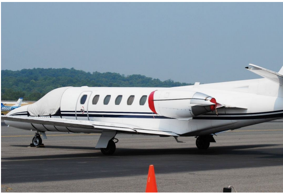
Raytheon Beechjet 400 Fuselage/Nose Cover, Engine Covers Cessna Citation S2 Cockpit Cover, Intake Covers & Exhaust Plugs