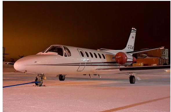
Cessna Citation 550 Engine Cover Set