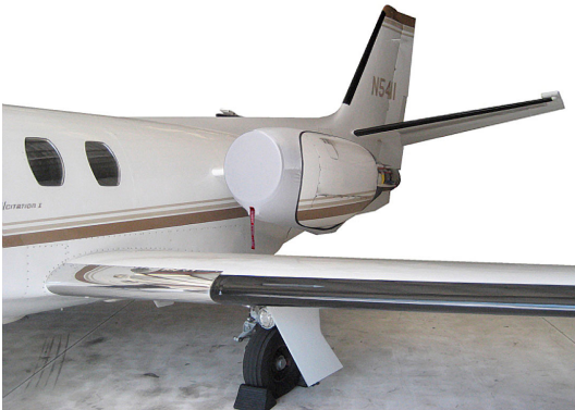
Cessna Citation II with TR's Exhaust Cover Illustration Cessna Citation "Bikini" Type Engine Covers: Extremely Light & Portable