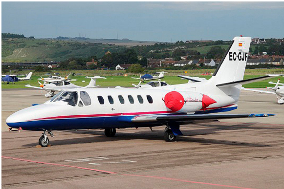
Cessna Citation II Engine Covers, Pitot Covers

The Cessna Citation I (500/501) Intake Covers are designed to install easily yet be completely storable. A spring steel hoop is sewn into the hem of each cover, allowing them to be installed without climbing onto the wing or using a stepladder. To store the covers the spring steel hoop folds like a band-saw blade into three nesting rings. Each cover folds into a compact circular bundle which is stored in the included duffle bag, yet they unfold quickly for use. The Tri-Fold Ring cover is made of medium weight nylon which is available in a variety of colors to match the paint trim. Each cover set comes complete with installation and folding instructions. The aircraft's registration number can be silkscreened onto the cover for an extra charge.