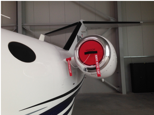
Citation Mustang Engine Intake Plugs

The Engine Inlet Plugs are custom fit for your Cessna Mustang 510 intakes, made with heavy-duty vinyl material, and stuffed with a single block of sculpted urethane foam. Each plug has a zipper that allows the foam to be removed and dried if necessary. Engine plugs have 'remove before flight' streamers sewn onto the face of the plugs. Most plugs are imprinted with the aircraft registration number in black for an extra charge. Storage bag NOT included. Engine plugs may be inserted after flight when the engine is still warm. Engine Inlet Plugs are commonly referred to as Cowl Plugs, Intake Plugs, Cowl Blocks, Engine Blocks, and Engine Bungs.