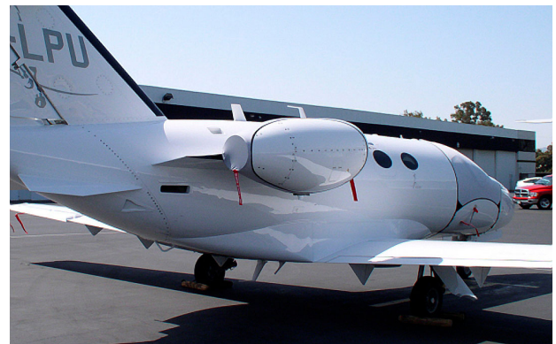
Citation Mustang Light Weight Engine Cover, Light Weight Windshield Cover, Pitot/AOA Cover