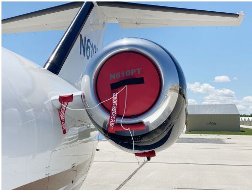
Cessna Citation Mustang 510 Engine Inlet Plugs, set of 8