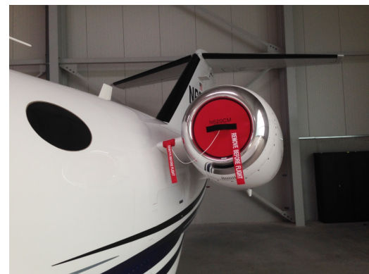
Citation Mustang Engine Intake Plugs