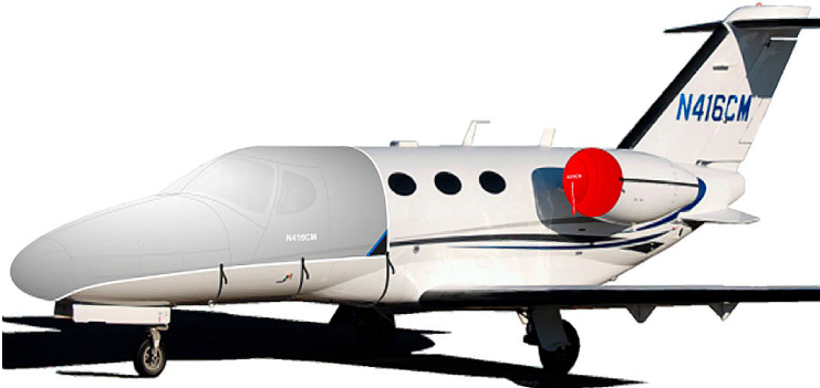
Citation Mustang Windshield Cover, Intake Cover/Exhaust Plug Set, Pitot Covers Citation Mustang Cockpit/Door/Nose Cover, Engine Inlet Cover