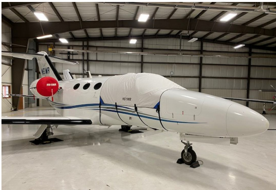
Citation Mustang Windshield Cover, Intake Cover/Exhaust Plug Set, Pitot Covers Cessna 510 Cockpit Cover extends to cover door