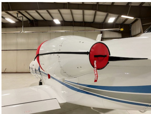
Cessna 510 Engine Inlet Covers & Exhaust Plugs

The Engine Inlet Plugs are custom fit for your Cessna Mustang 510 intakes, made with heavy-duty vinyl material, and stuffed with a single block of sculpted urethane foam. Each plug has a zipper that allows the foam to be removed and dried if necessary. Engine plugs have 'remove before flight' streamers sewn onto the face of the plugs. Most plugs are imprinted with the aircraft registration number in black for an extra charge. Storage bag NOT included. Engine plugs may be inserted after flight when the engine is still warm. Engine Inlet Plugs are commonly referred to as Cowl Plugs, Intake Plugs, Cowl Blocks, Engine Blocks, and Engine Bungs.