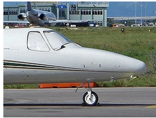
Cessna Citation S550 Cockpit HeatShields