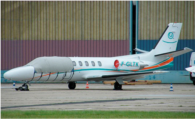
Citation Windshield Cover, to back of door