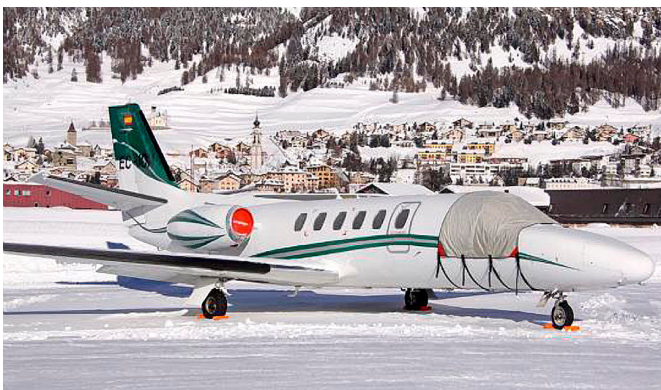
Cessna Citation 550 Windshield Cover

This cover type is made from Silver Acrylic Sunbrella canvas and is 100% lined with a soft and smooth microfiber. Bruce's Custom Covers developed this material combination especially for aircraft protection. The outer material is medium weight and treated for water resistance, UV resistance and anti-static buildup. The inner lining is a very soft and smooth microfiber to prevent scratching. The material is very reflective, and tests show that the cabin interior temperature can be reduced to near-ambient temperature on the hottest of days. It is water, ice and snow repellent, yet breathable to allow moisture to escape from between the cover and the aircraft surface.