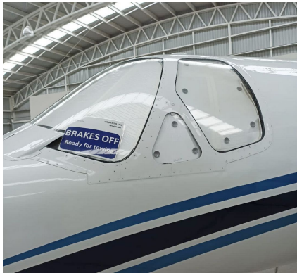
Cessna Citation I & II Cockpit HeatShields