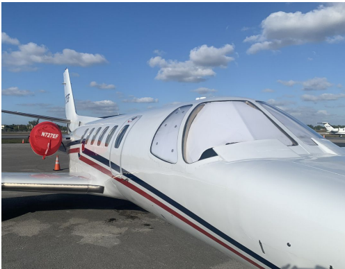
Cessna Citation S550

Custom-made Heatshield Sunshades are available for almost any window in the jet. Side windows, Skylights, and Emergency Exits are all custom-made. The product is a unique composite of closed-cell foam with a silver mylar finish. The set is easily stored in the included storage sleeve. Some designs may require velcro and suction cups. Our Heatshields are offered white side out since aircraft manufacturers have issued advisories against reflective window inserts due to potential heat damage.