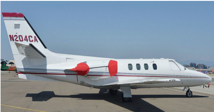
Cessna Citation Engine Covers and Heatshields

The Cessna Citation II (550, 551, UC-35A, with JT15D) Intake Covers are designed to install easily yet be completely storable. A spring steel hoop is sewn into the hem of each cover, allowing them to be installed without climbing onto the wing or using a stepladder. To store the covers the spring steel hoop folds like a band-saw blade into three nesting rings. Each cover folds into a compact circular bundle which is stored in the included duffle bag, yet they unfold quickly for use. The Tri-Fold Ring cover is made of medium weight nylon which is available in a variety of colors to match the paint trim. Each cover set comes complete with installation and folding instructions. The aircraft's registration number can be silkscreened onto the cover for an extra charge.