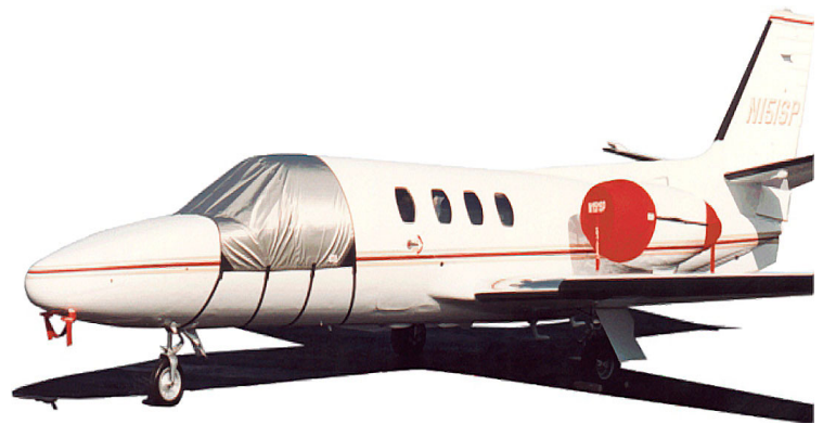
Cessna Citation Windshield, Pitot and Engine Covers