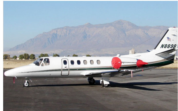
Citation Bravo Tri-Fold Engine Covers