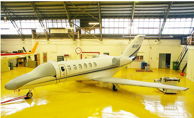
Cessna Citationjet CJ3 Cockpit/Nose, Engine & Wings Travel Covers