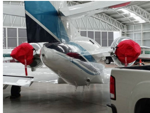
Cessna 551 Citation II SP Engine covers (with thrust reversers, smooth gen. inlet)