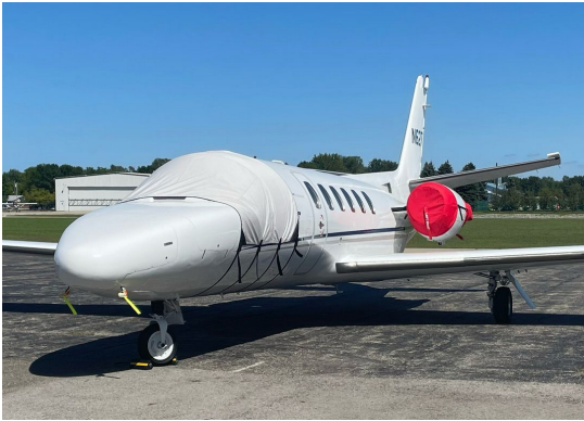
Cessna 550 Citation II

This cover type is made from Silver Acrylic Sunbrella canvas and is 100% lined with a soft and smooth microfiber. Bruce's Custom Covers developed this material combination especially for aircraft protection. The outer material is medium weight and treated for water resistance, UV resistance and anti-static buildup. The inner lining is a very soft and smooth microfiber to prevent scratching. The material is very reflective, and tests show that the cabin interior temperature can be reduced to near-ambient temperature on the hottest of days. It is water, ice and snow repellent, yet breathable to allow moisture to escape from between the cover and the aircraft surface.