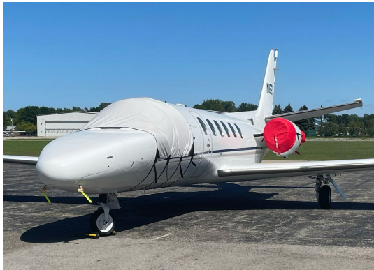
Cessna 550 Citation II

The Cessna Citation II (550, 551, UC-35A, with JT15D) Intake Covers are designed to install easily yet be completely storable. A spring steel hoop is sewn into the hem of each cover, allowing them to be installed without climbing onto the wing or using a stepladder. To store the covers the spring steel hoop folds like a band-saw blade into three nesting rings. Each cover folds into a compact circular bundle which is stored in the included duffle bag, yet they unfold quickly for use. The Tri-Fold Ring cover is made of medium weight nylon which is available in a variety of colors to match the paint trim. Each cover set comes complete with installation and folding instructions. The aircraft's registration number can be silkscreened onto the cover for an extra charge.