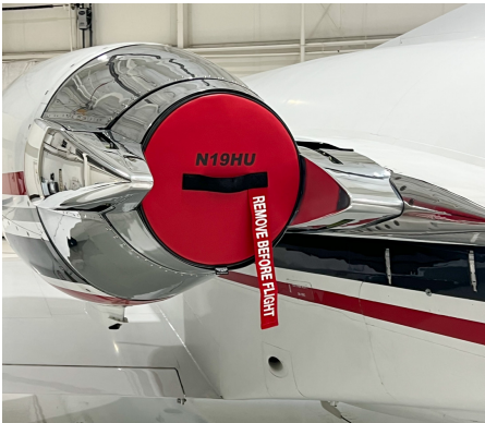
Cessna Citationjet V Ultra (560) Exhaust Plugs