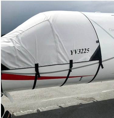
Cessna Citationjet V Ultra (560) Cockpit Cover

This cover type is made from Silver Acrylic Sunbrella canvas and is 100% lined with a soft and smooth microfiber. Bruce's Custom Covers developed this material combination especially for aircraft protection. The outer material is medium weight and treated for water resistance, UV resistance and anti-static buildup. The inner lining is a very soft and smooth microfiber to prevent scratching. The material is very reflective, and tests show that the cabin interior temperature can be reduced to near-ambient temperature on the hottest of days. It is water, ice and snow repellent, yet breathable to allow moisture to escape from between the cover and the aircraft surface.