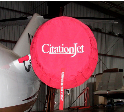
Cessna Citation Engine Cover Set