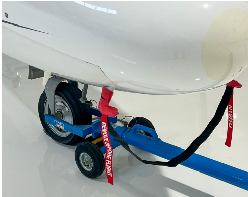
Cessna Citationjet V Ultra (560) Exhaust Plugs

The Engine Inlet Plugs are custom fit for your Cessna Citationjet V Ultra (560) intakes, made with heavy-duty vinyl material, and stuffed with a single block of sculpted urethane foam. Each plug has a zipper that allows the foam to be removed and dried if necessary. Engine plugs have 'remove before flight' streamers sewn onto the face of the plugs. Most plugs are imprinted with the aircraft registration number in black for an extra charge. Storage bag NOT included. Engine plugs may be inserted after flight when the engine is still warm. Engine Inlet Plugs are commonly referred to as Cowl Plugs, Intake Plugs, Cowl Blocks, Engine Blocks, and Engine Bungs.