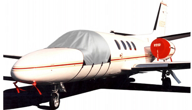
Cessna Citation 560XL Upper Nacelle/Brightwork Covers Cessna Citation Windshield Cover, Engine Cover set and Pitot Covers