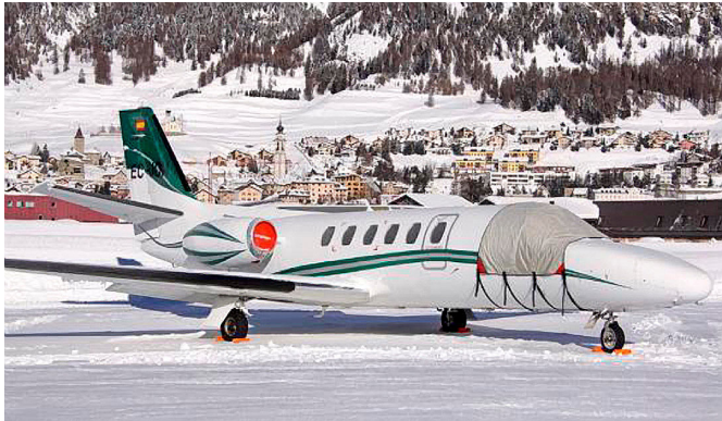
Cessna Citation 550 Windshield Cover