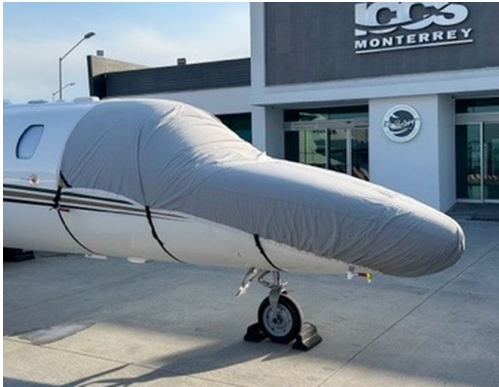
Cessna Citationjet 525B Travel Weight Cockpit/Nose Cover

This cover type is made from Silver Acrylic Sunbrella canvas and is 100% lined with a soft and smooth microfiber. Bruce's Custom Covers developed this material combination especially for aircraft protection. The outer material is medium weight and treated for water resistance, UV resistance and anti-static buildup. The inner lining is a very soft and smooth microfiber to prevent scratching. The material is very reflective, and tests show that the cabin interior temperature can be reduced to near-ambient temperature on the hottest of days. It is water, ice and snow repellent, yet breathable to allow moisture to escape from between the cover and the aircraft surface.