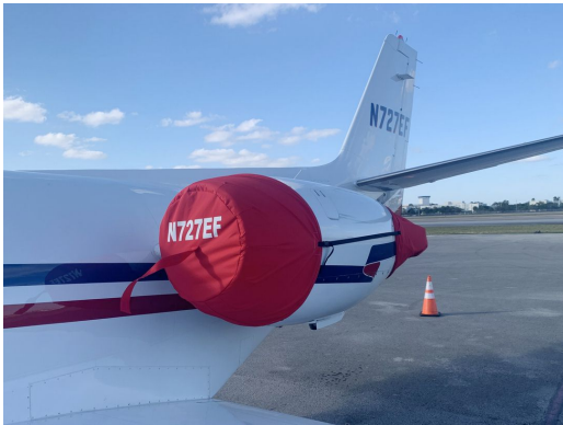
Cessna Citation S550