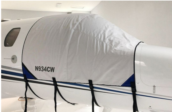
Cessna Citation M2 Cockpit Cover

This cover type is made from Silver Acrylic Sunbrella canvas and is 100% lined with a soft and smooth microfiber. Bruce's Custom Covers developed this material combination especially for aircraft protection. The outer material is medium weight and treated for water resistance, UV resistance and anti-static buildup. The inner lining is a very soft and smooth microfiber to prevent scratching. The material is very reflective, and tests show that the cabin interior temperature can be reduced to near-ambient temperature on the hottest of days. It is water, ice and snow repellent, yet breathable to allow moisture to escape from between the cover and the aircraft surface.