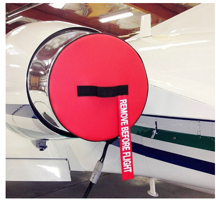
Cessna Citation S2 Exhaust Plugs