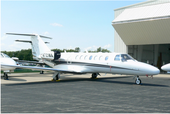
Cessna Citation CJ3 Bikini Style Engine Covers

The Cessna Citation II Bravo Intake/Exhaust Plugs are custom fit for the intake and exhaust openings, made with heavy-duty vinyl material, and stuffed with a single block of sculpted urethane foam. Each plug has a zipper that allows the foam to be removed and dried if necessary. Engine plugs have 'remove before flight' streamers sewn onto the face of the plugs. Most plugs are imprinted with the aircraft registration number in black. Engine plugs may be inserted after flight when the engine is still warm. Engine Inlet Plugs are commonly referred to as Cowl Plugs, Intake Plugs, Cowl Blocks, Engine Blocks, and Engine Bungs.