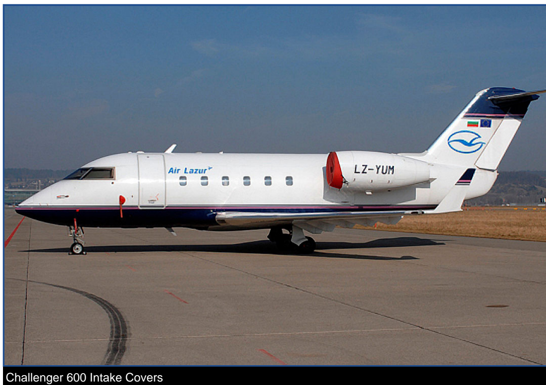
Challenger 600 Intake Covers