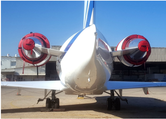
Canadair Challenger 604, 605, 650, 850 Exhaust Plugs

with the aircraft registration number in black for an extra charge. Storage bag NOT included. Engine plugs may be inserted after flight when the engine is still warm. Engine Inlet Plugs are commonly referred to as Cowl Plugs, Intake Plugs, Cowl Blocks, Engine Blocks, and Engine Bungs.