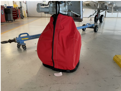
Canadair Challenger 605 Nose Gear Tire Cover

ALL-YEAR USE MATERIAL - Made with Silver Acrylic Sunbrella canvas, the all-year use material is the best option for sun protection and cover longevity. This heavier more durable material is intended for all weather conditions, such as rain and snow or lots of sun.