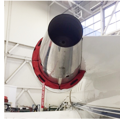
Canadair Challenger 604 Bypass Plugs