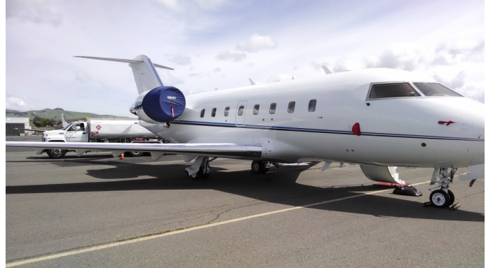
Challenger 604 Intake Covers