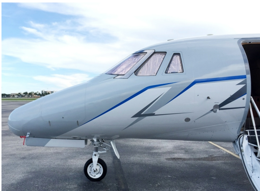
Cessna Citation 650 Cockpit HeataShields

Cockpit Heatshields are interior sunshades for the aircraft's cockpit. The product is a unique composite of closed-cell foam with a silver mylar finish. The semi-rigid design is stiff enough to stand inside the window framing. The set folds up flat and is easily stored in the included storage sleeve. Some designs may require velcro and suction cups. Our Heatshields for jets are offered white side out because some aircraft manufacturers have issued advisories against reflective window inserts due to potential heat damage. A Heatshield is an excellent short-term remedy for cockpit overheating, but an external fabric cover is more effective for long-term protection.