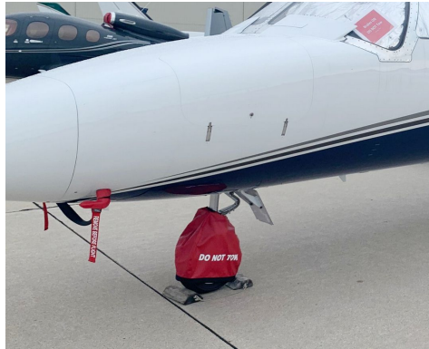
Cessna Citation Nose Tire Cover

ALL-YEAR USE MATERIAL - Made with Silver Acrylic Sunbrella canvas, the all-year use material is the best option for sun protection and cover longevity. This heavier more durable material is intended for all weather conditions, such as rain and snow or lots of sun.