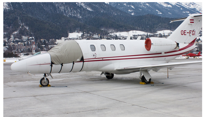
Cessna Citationjet CJ1 Cockpit Cover