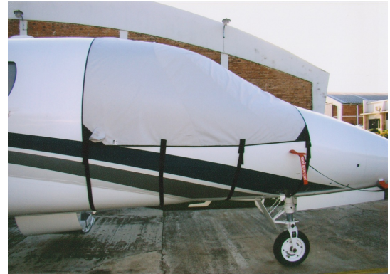
Citation XL Cockpit Cover