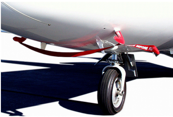
Cessna Citation I Pitot Covers