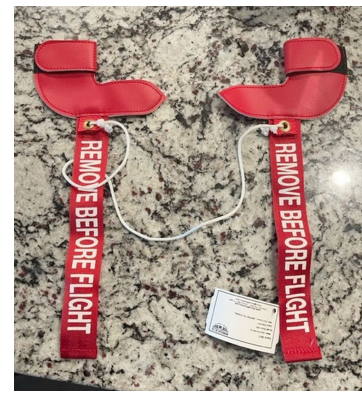
Cessna Citation Pitot Cover Set