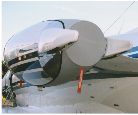
Citation XL Bikini Style Engine Covers