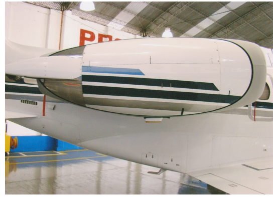
Citation XL Bikini Style Engine Covers