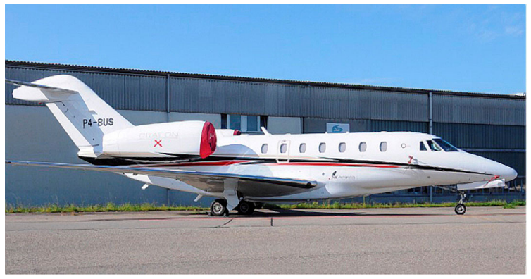
Citation X Intake & Pitot Tube Covers