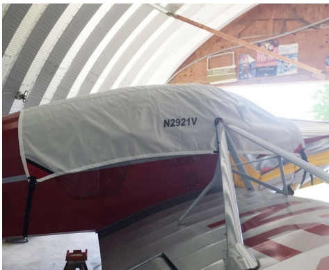
Callair A-2 Canopy Cover