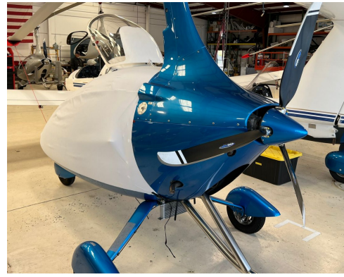
Autogyro Calidus Canopy/Nose Cover, test fit cover