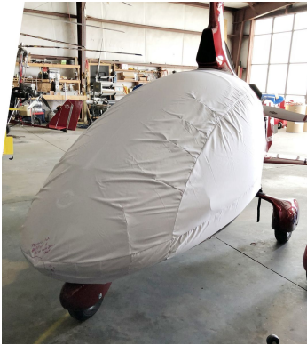
Cavalon Gyrocopter Bubble Cover, test fit cover

Travel Covers are made with Silver Solution-Dyed Polyester fabric and fully lined over the entire cover. The material is lightweight and more compact for easy storage in the aircraft. The polyester material is water resistant, but only intended for occasional use outside. We also have an ultra lightweight material available for fitted hangar dust covers. For daily outdoor use, the non-travel Sunbrella Cover is the best choice.