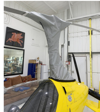
Autogyro Calidus Gyrocopter Rotor Hub/Mast Cover