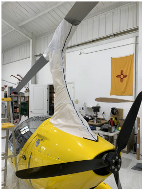
Calidus Gyrocopter Rotor Mast Cover, test fit cover

Rotor Hub Covers overlaps with the Blade Covers to ensure complete protection for the entire main rotor system. Designed like a jacket with sleeves and no collar, the rotor hub cover fastens together below each blade with Delrin buckles. The Rotor Hub Cover is normally made from Solution-Dyed Polyester.