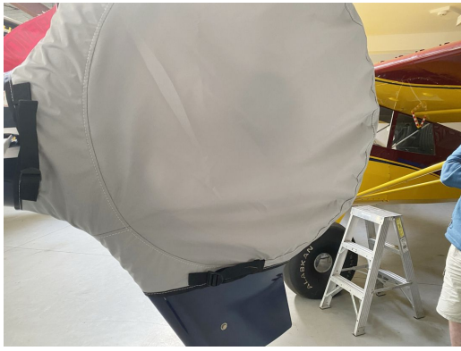
Guimbal Cabri G2 Tailfan Housing Fenestron Cover