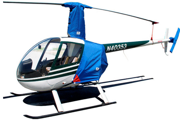
Robinson R-22 Engine, Rotor Mast & Tail Rotor Covers, with Blade Tie-down