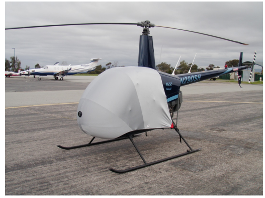
Robinson R-22 Light Weight Travel Cover