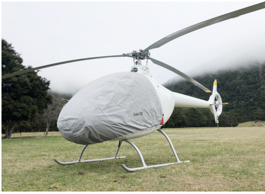
Guimbal Cabri CG2 Bubble Cover, light weight travel type