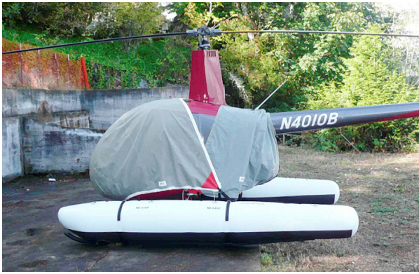
Robinson R-22 Standard Bubble Cover & Engine Cover