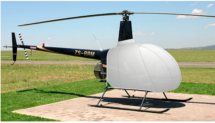
Robinson R-22 Extended Canopy Cover (illustration)