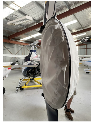
Guimbal Cabri G2 Tailfan Housing Fenestron Cover