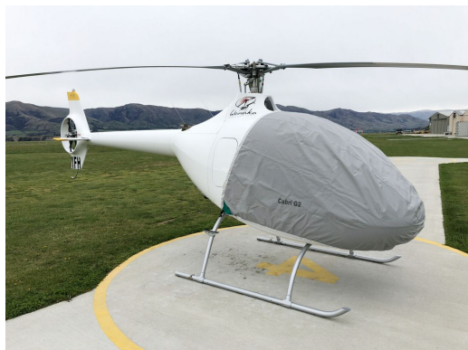
Guimbal Cabri CG2 Bubble Cover, light weight travel type

Travel Covers are made with Silver Solution-Dyed Polyester fabric and fully lined over the entire cover. The material is lightweight and more compact for easy storage in the aircraft. The polyester material is water resistant, but only intended for occasional use outside. We also have an ultra lightweight material available for fitted hangar dust covers. For daily outdoor use, the non-travel Sunbrella Cover is the best choice.