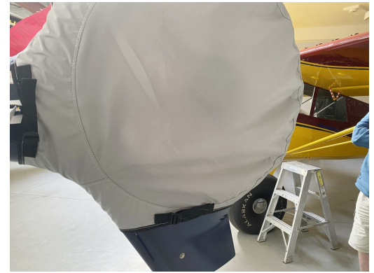
Robinson R-22 Engine, Rotor Mast & Tail Rotor Covers, with Blade Tie-down Guimbal Cabri G2 Tailfan Housing Fenestron Cover