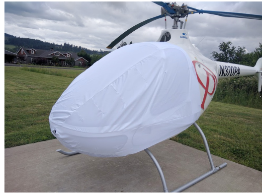
Guimbal Cabri G2 Bubble Cover, test fit cover