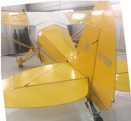
Piper Pacer Over-Top Canopy Cover