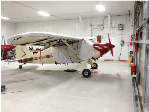
Piper PA-20 Extended Canopy Cover, Wing Covers

This cover type is made from Silver Acrylic Sunbrella canvas and is 100% lined with a soft and smooth microfiber. Bruce's Custom Covers developed this material combination especially for aircraft protection. The outer material is medium weight and treated for water resistance, UV resistance and anti-static buildup. The inner lining is a very soft and smooth microfiber to prevent scratching. The material is very reflective, and tests show that the cabin interior temperature can be reduced to near-ambient temperature on the hottest of days. It is water, ice and snow repellent, yet breathable to allow moisture to escape from between the cover and the aircraft surface.