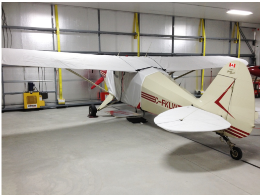
Piper PA-20 Extended Canopy Cover, Wing & Horiz. Stab. Covers

WINTER USE MATERIAL - Made with Solution-Dyed Polyester fabric, this option is intended for seasonal use to aid in deicing, rain mitigation, or for occasional travel. The material is lighter and more compact, but more susceptible to UV damage and may have a shorter useful life if used continuously outside than the all-year use material.