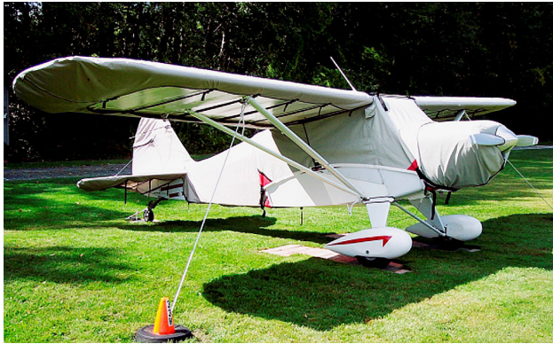
Piper Clipper Canopy, Engine, Empennage & Wing Covers