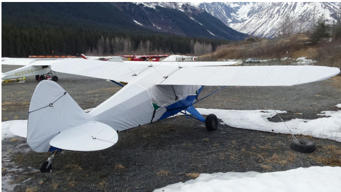
Piper Pacer PA-22 Over-Top Canopy Cover, Wing and Empennage Covers