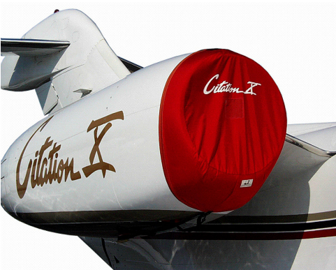
Citation X Intake Covers

The Cessna Citation X (750) Intake Covers are designed to install easily yet be completely storable. A spring steel hoop is sewn into the hem of each cover, allowing them to be installed without climbing onto the wing or using a stepladder. To store the covers the spring steel hoop folds like a band-saw blade into three nesting rings. Each cover folds into a compact circular bundle which is stored in the included duffle bag, yet they unfold quickly for use. The Tri-Fold Ring cover is made of medium weight nylon which is available in a variety of colors to match the paint trim. Each cover set comes complete with installation and folding instructions. The aircraft's registration number can be silkscreened onto the cover for an extra charge.