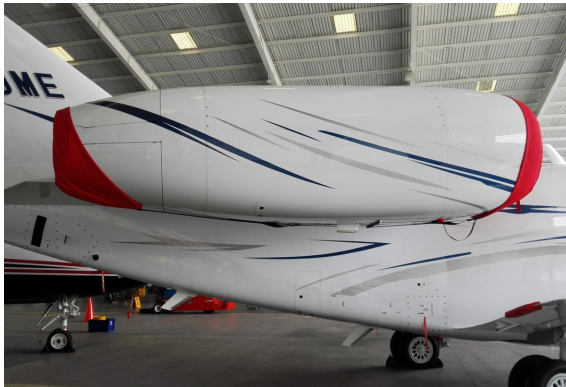
Citation X Intake/Exhaust Cover Set