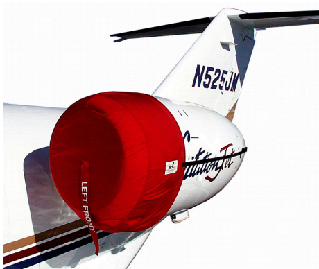
Engine Inlet Cover

The Cessna Citationjet 525B, CJ-3 Intake/Exhaust Plugs are custom fit for the intake and exhaust openings, made with heavy-duty vinyl material, and stuffed with a single block of sculpted urethane foam. Each plug has a zipper that allows the foam to be removed and dried if necessary. Engine plugs have 'remove before flight' streamers sewn onto the face of the plugs. Most plugs are imprinted with the aircraft registration number in black. Engine plugs may be inserted after flight when the engine is still warm. Engine Inlet Plugs are commonly referred to as Cowl Plugs, Intake Plugs, Cowl Blocks, Engine Blocks, and Engine Bungs.