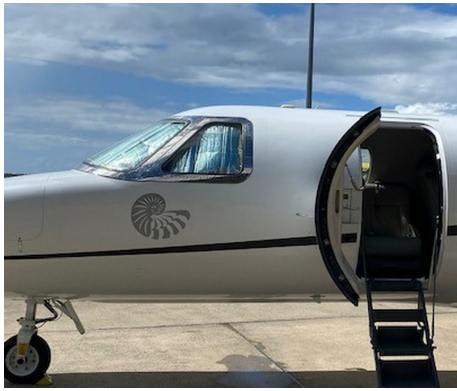
Cessna Citationjet CJ2 Cockpit HeatShields