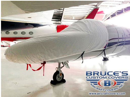
Citation CJ4 Cockpit/Nose Cover and Heat Resistant Pitot Covers set