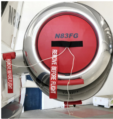
Cessna Citation Mustang 510 Engine Plugs

the engine is still warm. Engine Inlet Plugs are commonly referred to as Cowl Plugs, Intake Plugs, Cowl Blocks, Engine Blocks, and Engine Bungs.