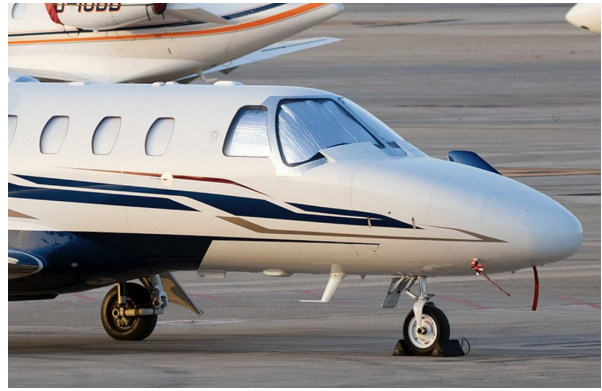
Cessna Citationjet 525, CJ-I, CJ1+, & M2 Cockpit Heatshields