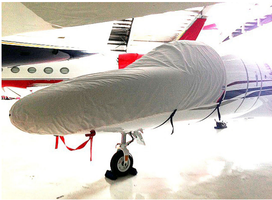
Citation CJ4 Cockpit/Nose Cover and Heat Resistant Pitot Covers set