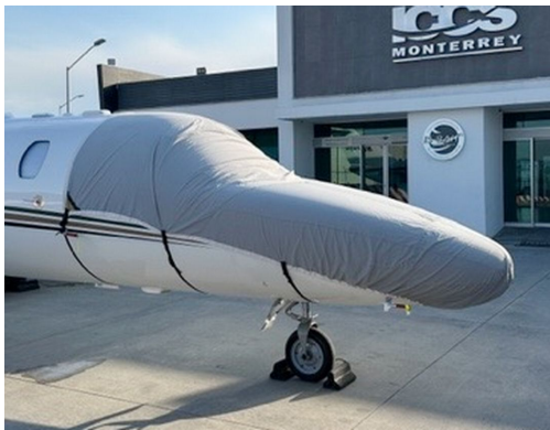
Cessna Citationjet 525B Travel Weight Cockpit/Nose Cover

This cover type is made from Silver Acrylic Sunbrella canvas and is 100% lined with a soft and smooth microfiber. Bruce's Custom Covers developed this material combination especially for aircraft protection. The outer material is medium weight and treated for water resistance, UV resistance and anti-static buildup. The inner lining is a very soft and smooth microfiber to prevent scratching. The material is very reflective, and tests show that the cabin interior temperature can be reduced to near-ambient temperature on the hottest of days. It is water, ice and snow repellent, yet breathable to allow moisture to escape from between the cover and the aircraft surface.