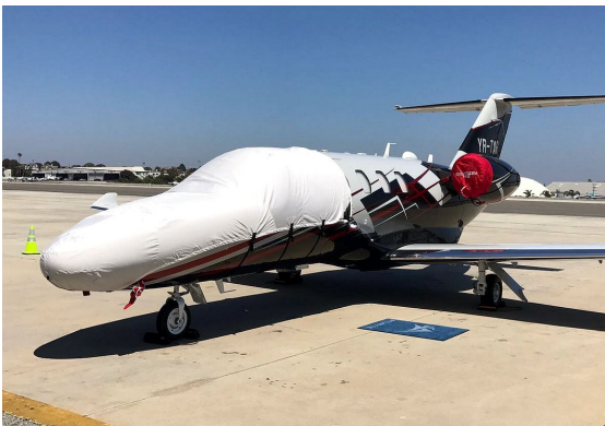
Citationjet CJ1 Cockpit/Nose Cover