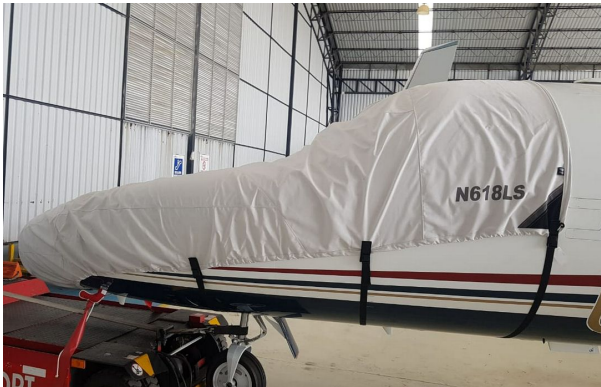
Citationjet 525B Cockpit/Nose Cover

This cover type is made from Silver Acrylic Sunbrella canvas and is 100% lined with a soft and smooth microfiber. Bruce's Custom Covers developed this material combination especially for aircraft protection. The outer material is medium weight and treated for water resistance, UV resistance and anti-static buildup. The inner lining is a very soft and smooth microfiber to prevent scratching. The material is very reflective, and tests show that the cabin interior temperature can be reduced to near-ambient temperature on the hottest of days. It is water, ice and snow repellent, yet breathable to allow moisture to escape from between the cover and the aircraft surface.