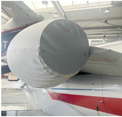
Citationjet 525C, CJ4, Complete Nacelle Cover, light weight Spandex