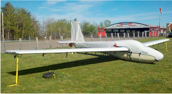
Schweizer 1-26B Canopy/Nose, Empennage & Wing Covers