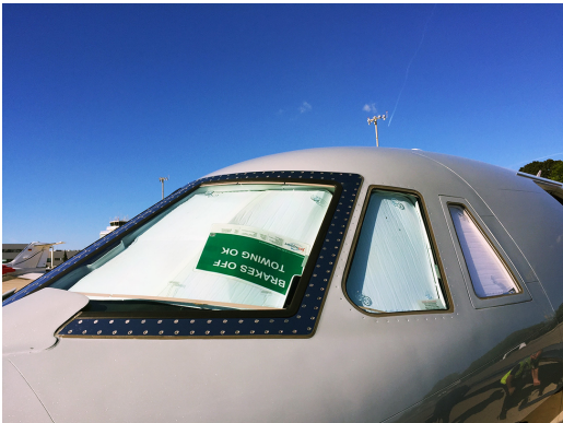
Cessna Citation XL, XLS (560XL) Cockpit Heatshields

Cockpit Heatshields are interior sunshades for the aircraft's cockpit. The product is a unique composite of closed-cell foam with a silver mylar finish. The semi-rigid design is stiff enough to stand inside the window framing. The set folds up flat and is easily stored in the included storage sleeve. Some designs may require velcro and suction cups. Our Heatshields for jets are offered white side out because some aircraft manufacturers have issued advisories against reflective window inserts due to potential heat damage. A Heatshield is an excellent short-term remedy for cockpit overheating, but an external fabric cover is more effective for long-term protection.