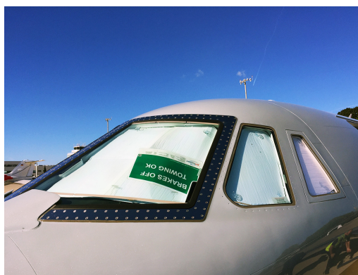
Cessna Citation XL, XLS (560XL) Cockpit Heatshields