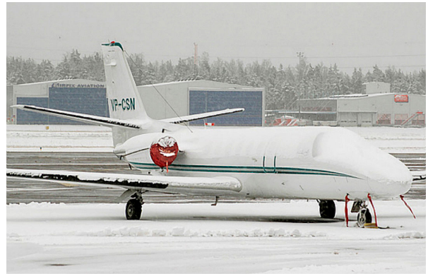
Cessna 560 Engine Inlet/Exhaust Covers, Pitot Cover Set