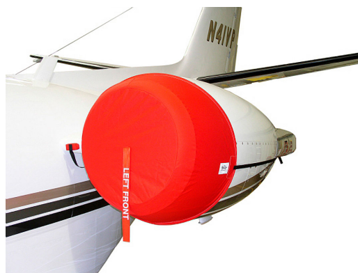
Citation Encore Intake Cover Set