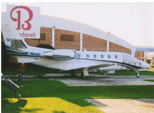
Citation XL Cockpit Cover & Bikini Type Engine Cover