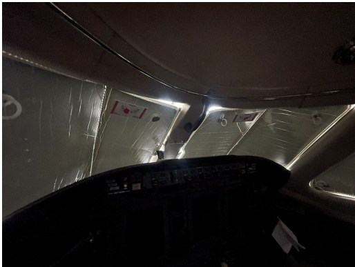
Cessna Citation 560XL Cockpit Heatshields