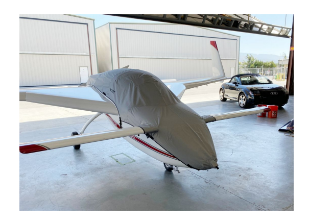
Cozy Mk IV Canopy/Nose/Engine Cover, travel weight design