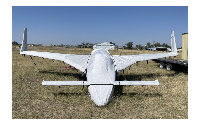
Cozy Mk IV Complete Cover Set

WINTER USE MATERIAL - Made with Solution-Dyed Polyester fabric, this option is intended for seasonal use to aid in deicing, rain mitigation, or for occasional travel. The material is lighter and more compact, but more susceptible to UV damage and may have a shorter useful life if used continuously outside than the all-year use material.