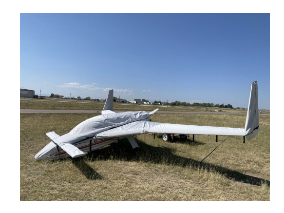
Cozy Mk IV Complete Cover Set