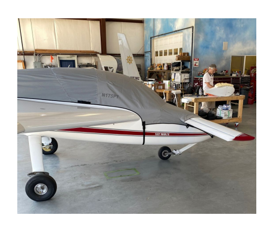
Cozy Mk IV Canopy/Nose/Engine Cover, travel weight design