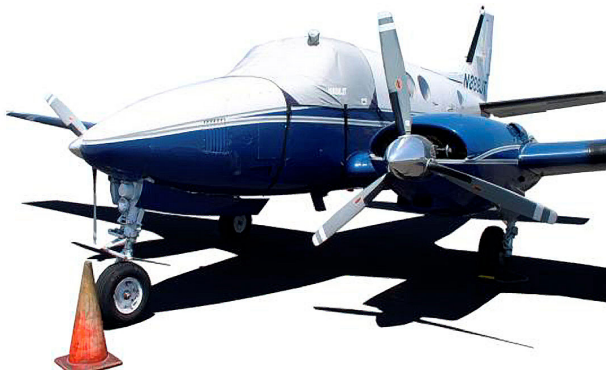
King Air Cockpit Cover, belly-strap type