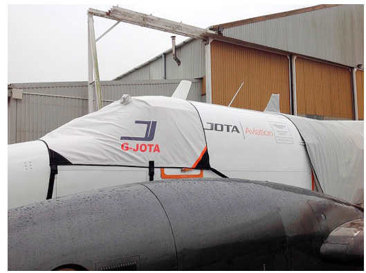
King Air Windshield/Cockpit Cover