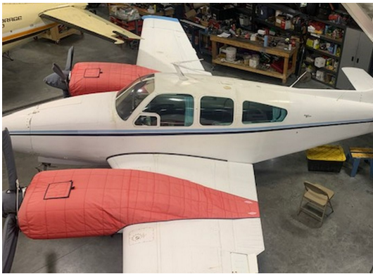
Beech Baron B55 Insulated Engine Covers