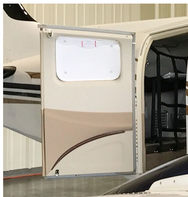
Beech Baron 58 Cabin HeatShield

Windshield Heatshields are interior sunshades for an aircraft's front windshield. The product is a unique composite of closed-cell foam with a silver mylar finish. The semi-rigid design is stiff enough to stand along the inside of the windshield using sun visors or window framing. It folds up flat and easily stores in the included storage sleeve. Some designs may require velcro and suction cups or split right and left sides. A Heatshield is an excellent short-term remedy for cockpit overheating. An external fabric cover is far more effective and practical for long-term protection.