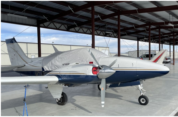
Beech Baron D55 Canopy Cover, Engine Plugs