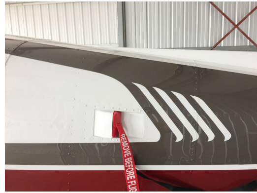
Beech Bonanza/Baron Fresh Air Intake & Exhaust Plugs