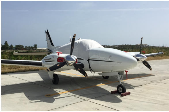
Baron 58 Canopy Cover, Engine Plugs