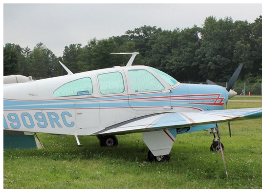
Beech Bonanza/Debonair HeatShield Set