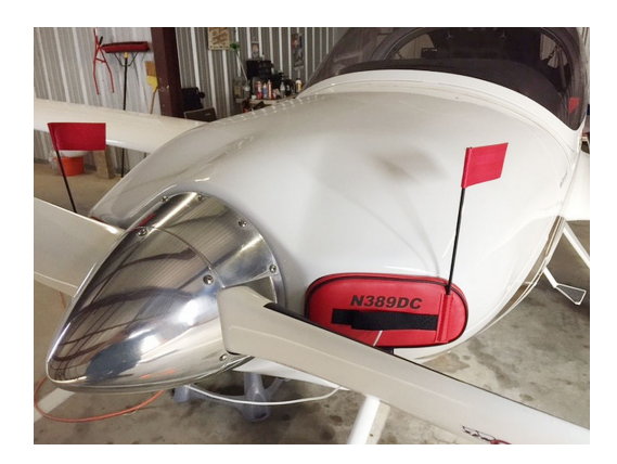
Diamond DA-20-C1 Engine Inlet Plugs

Engine Inlet Plugs are custom fit for your Diamond DA-20, Katana, Eclipse intakes, made with heavy-duty vinyl material, and stuffed with a single block of sculpted urethane foam. Each plug has a zipper that allows the foam to be removed and dried if necessary. Engine plugs have warning flags that are visible from the cockpit or 'remove before flight' streamers sewn onto the face of the plugs. Most plugs are imprinted with the aircraft registration number in black for an extra charge. Storage bag NOT included. Engine plugs may be inserted after flight when the engine is still warm. Engine Inlet Plugs are commonly referred to as Cowl Plugs, Intake Plugs, Cowl Blocks, Engine Blocks, and Engine Bungs.