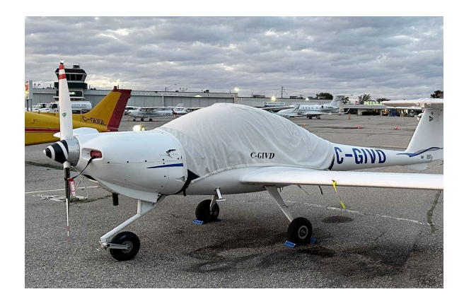
Diamond DA-20 Canopy Cover