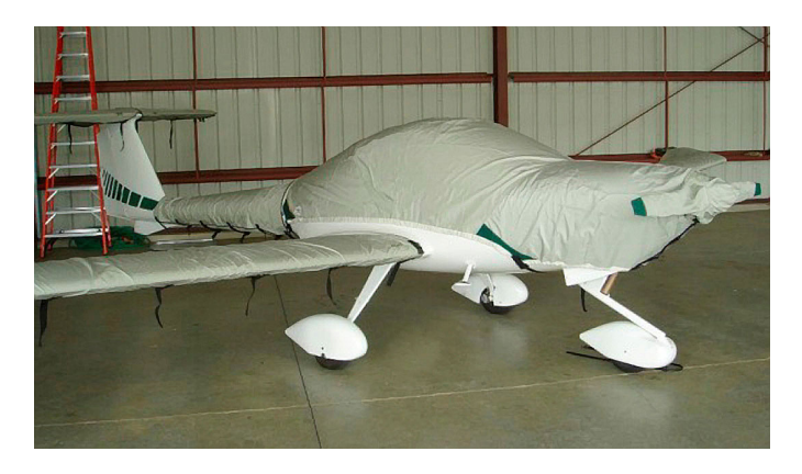
Diamond DA-20 Canopy/Engine Cover (Travel Weight), Prop DA-20 Canopy/Engine, Prop/Spinner, Wing, Tailboom, Horiz. Stab. Cover Covers