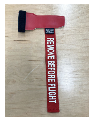
Pitot Tube Cover