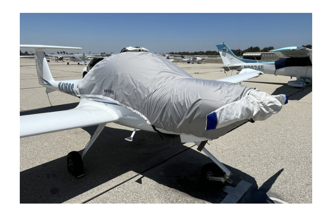
Diamond DA-20 Canopy/Engine Cover (Travel Weight), Prop Cover

This cover type is made from Silver Acrylic Sunbrella canvas and is 100% lined with a soft and smooth microfiber. Bruce's Custom Covers developed this material combination especially for aircraft protection. The outer material is medium weight and treated for water resistance, UV resistance and anti-static buildup. The inner lining is a very soft and smooth microfiber to prevent scratching. The material is very reflective, and tests show that the cabin interior temperature can be reduced to near-ambient temperature on the hottest of days. It is water, ice and snow repellent, yet breathable to allow moisture to escape from between the cover and the aircraft surface.