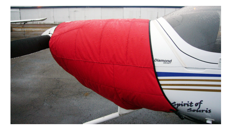
Diamond DA-20-C1 Insulated Engine Cover

This cover type is made from Silver Acrylic Sunbrella canvas and is 100% lined with a soft and smooth microfiber. Bruce's Custom Covers developed this material combination especially for aircraft protection. The outer material is medium weight and treated for water resistance, UV resistance and anti-static buildup. The inner lining is a very soft and smooth microfiber to prevent scratching. The material is very reflective, and tests show that the cabin interior temperature can be reduced to near-ambient temperature on the hottest of days. It is water, ice and snow repellent, yet breathable to allow moisture to escape from between the cover and the aircraft surface.