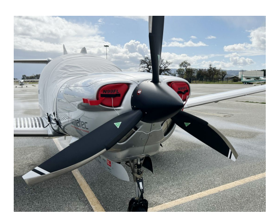
Diamond DA-50 Engine Plugs