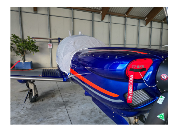
Diamond DA-50 Canopy Cover, Engine Plugs

Engine Inlet Plugs are custom fit for your Diamond DA-50 Superstar intakes, made with heavy-duty vinyl material, and stuffed with a single block of sculpted urethane foam. Each plug has a zipper that allows the foam to be removed and dried if necessary. Engine plugs have warning flags that are visible from the cockpit or 'remove before flight' streamers sewn onto the face of the plugs. Most plugs are imprinted with the aircraft registration number in black for an extra charge. Storage bag NOT included. Engine plugs may be inserted after flight when the engine is still warm. Engine Inlet Plugs are commonly referred to as Cowl Plugs, Intake Plugs, Cowl Blocks, Engine Blocks, and Engine Bungs.