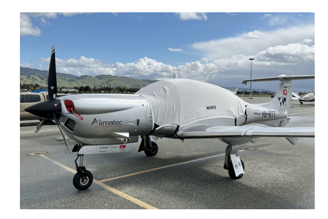
Diamond DA-50 Canopy Cover