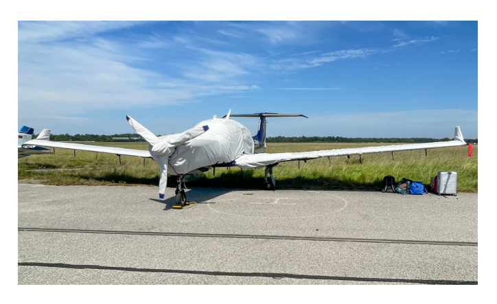
Diamond DA-50 Extended Canopy/Engine Cover, Wing & Prop Covers