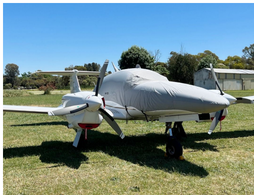
Diamond DA-62 Travel Weight Canopy/Nose Cover