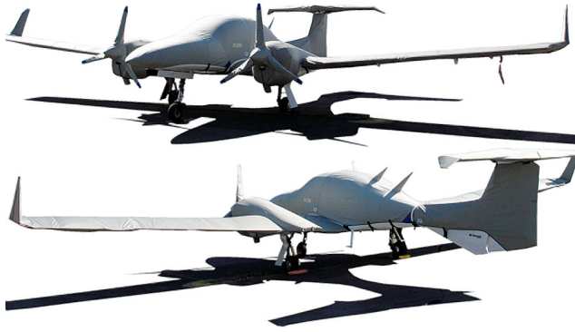
DA-42 Full Cover Set: Extended Canopy/Nose, Wing/Engine, Prop, Empennage