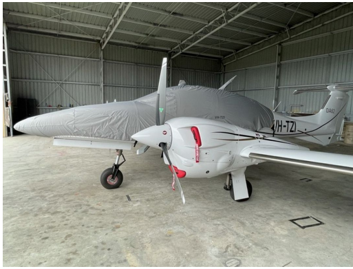
DA-62 Travel Weight Canopy/Nose Cover, Engine Plugs