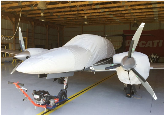
Diamond DA-42-VI Canopy/Nose & Engine Covers

the hottest of days. It is water, ice and snow repellent, yet breathable to allow moisture to escape from between the cover and the aircraft surface.