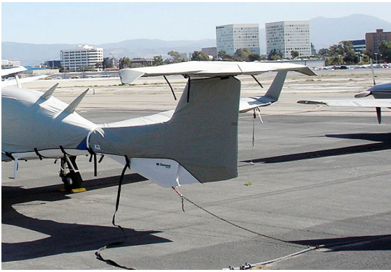
DA-42 Empennage & Horiz. Stab. Covers