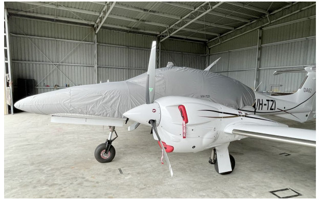
Diamond DA-62 Canopy/Nose Cover, Engine Plugs