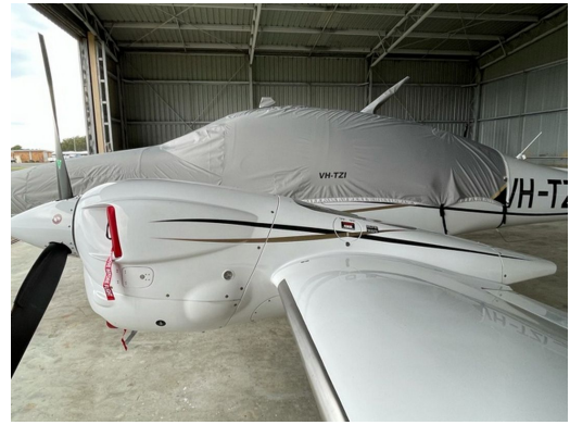
DA-62 Travel Weight Canopy/Nose Cover, Engine Plugs