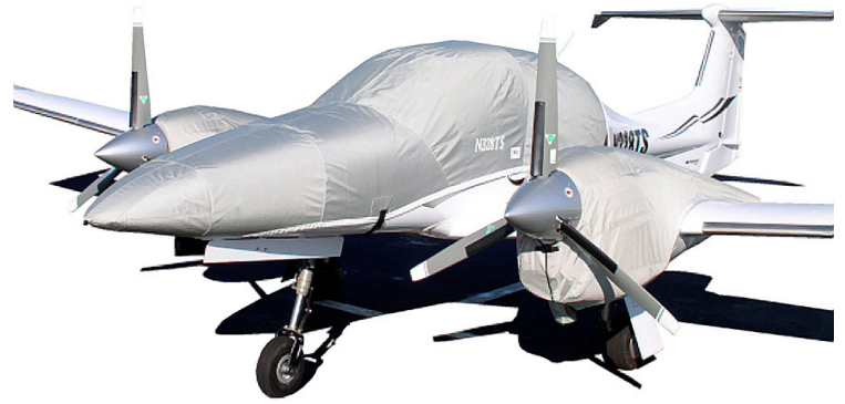
Diamond Twinstar Canopy/Nose Cover & Engine Covers