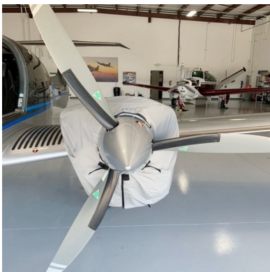
Diamond DA-62 Travel Weight Engine Covers