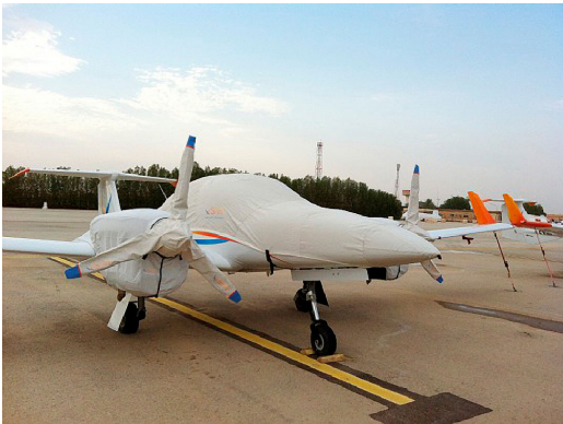
Diamond DA-42NG Canopy/Nose, Engine & Prop Covers