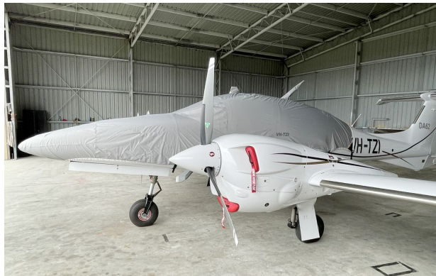
Diamond DA-62 Canopy/Nose Cover, Engine Plugs

Engine Inlet Plugs are custom fit for your Diamond DA-62 intakes, made with heavy-duty vinyl material, and stuffed with a single block of sculpted urethane foam. Each plug has a zipper that allows the foam to be removed and dried if necessary. Engine plugs have warning flags that are visible from the cockpit or 'remove before flight' streamers sewn onto the face of the plugs. Most plugs are imprinted with the aircraft registration number in black for an extra charge. Storage bag NOT included. Engine plugs may be inserted after flight when the engine is still warm. Engine Inlet Plugs are commonly referred to as Cowl Plugs, Intake Plugs, Cowl Blocks, Engine Blocks, and Engine Bungs.