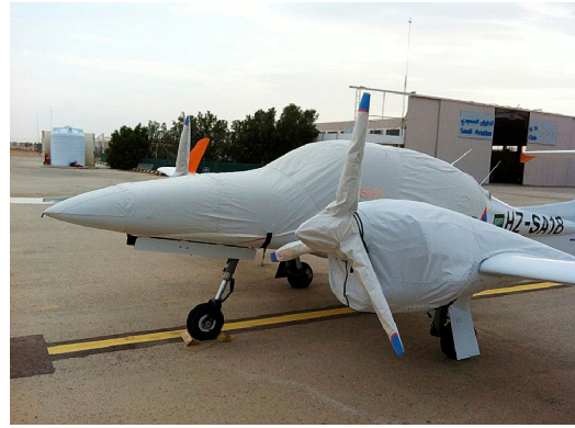
Diamond DA-42NG Canopy/Nose, Engine & Prop Covers