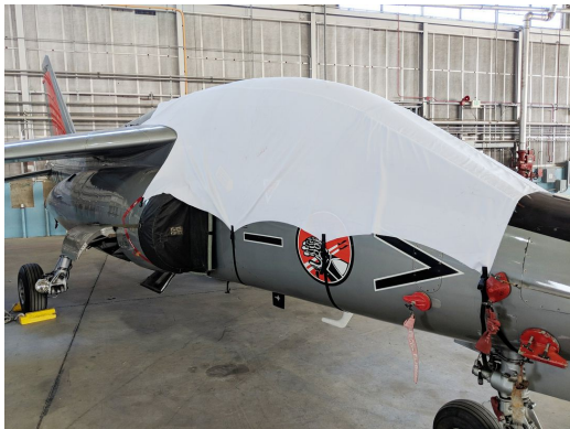
Dornier Alpha Jet Canopy Cover, test fit cover