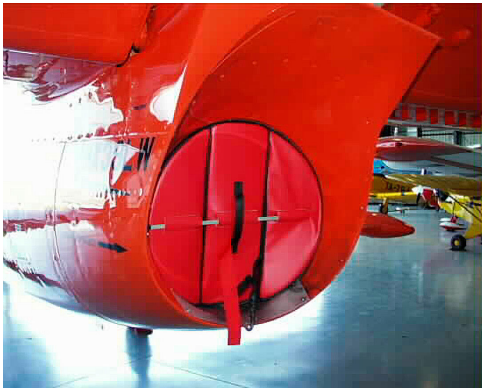
Exhaust Plug, folding type