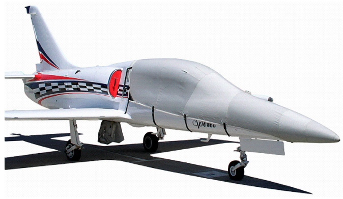
L39 Canopy/Nose Cover & Intake Plugs