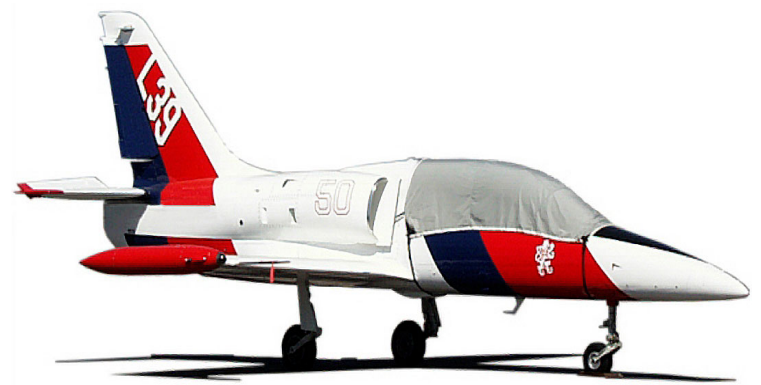
Canopy Cover for Aero L-39 Albatros