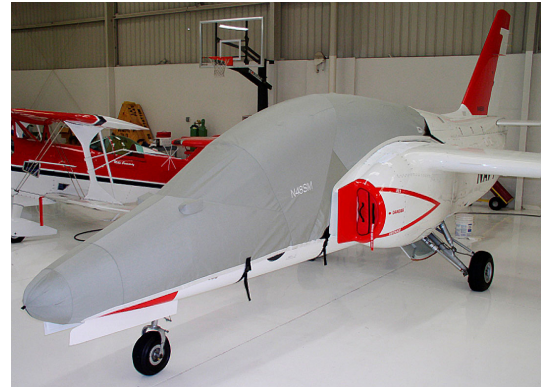
S-21 Canopy/Nose Cover & Engine Plugs