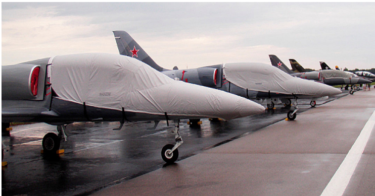
L-39 Canopy/Nose Covers & Plugs

This cover type is made from Silver Acrylic Sunbrella canvas and is 100% lined with a soft and smooth microfiber. Bruce's Custom Covers developed this material combination especially for aircraft protection. The outer material is medium weight and treated for water resistance, UV resistance and anti-static buildup. The inner lining is a very soft and smooth microfiber to prevent scratching. The material is very reflective, and tests show that the cabin interior temperature can be reduced to near-ambient temperature on the hottest of days. It is water, ice and snow repellent, yet breathable to allow moisture to escape from between the cover and the aircraft surface.