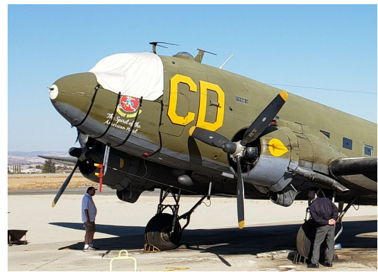
Douglas DC-3 Cockpit Cover