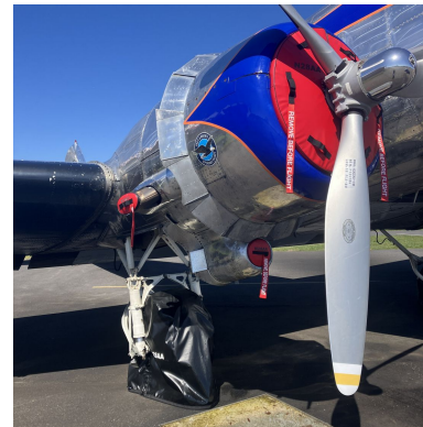
DC-3 Engine Plugs, Tire Covers