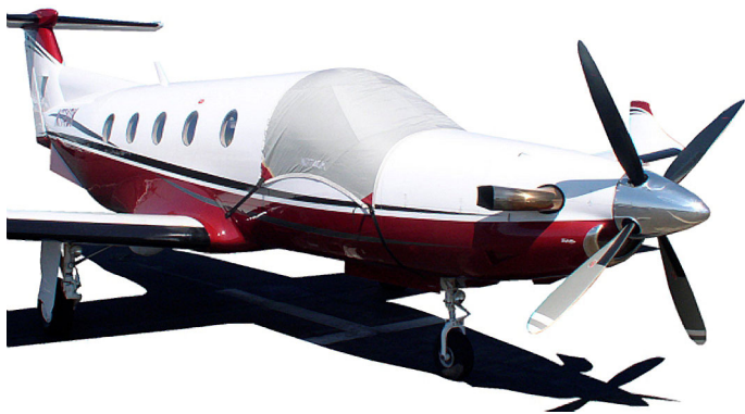
PC-12 Windshield Cover

This cover type is made from Silver Acrylic Sunbrella canvas and is 100% lined with a soft and smooth microfiber. Bruce's Custom Covers developed this material combination especially for aircraft protection. The outer material is medium weight and treated for water resistance, UV resistance and anti-static buildup. The inner lining is a very soft and smooth microfiber to prevent scratching. The material is very reflective, and tests show that the cabin interior temperature can be reduced to near-ambient temperature on the hottest of days. It is water, ice and snow repellent, yet breathable to allow moisture to escape from between the cover and the aircraft surface.