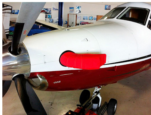
Pilatus PC-12 Exhaust Cover, Fully Enclosed, for protection against corrosion.