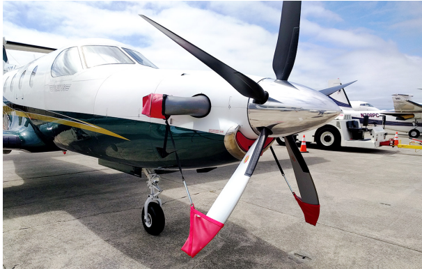
Main Intake Plug and Prop-Tie/Exhaust Covers. (Sold Separately)

Engine Inlet Plugs are custom fit for your Beech Denali 220 intakes, made with heavy-duty vinyl material, and stuffed with a single block of sculpted urethane foam. Each plug has a zipper that allows the foam to be removed and dried if necessary. Engine plugs have warning flags that are visible from the cockpit or 'remove before flight' streamers sewn onto the face of the plugs. Most plugs are imprinted with the aircraft registration number in black for an extra charge. Storage bag NOT included. Engine plugs may be inserted after flight when the engine is still warm. Engine Inlet Plugs are commonly referred to as Cowl Plugs, Intake Plugs, Cowl Blocks, Engine Blocks, and Engine Bungs.