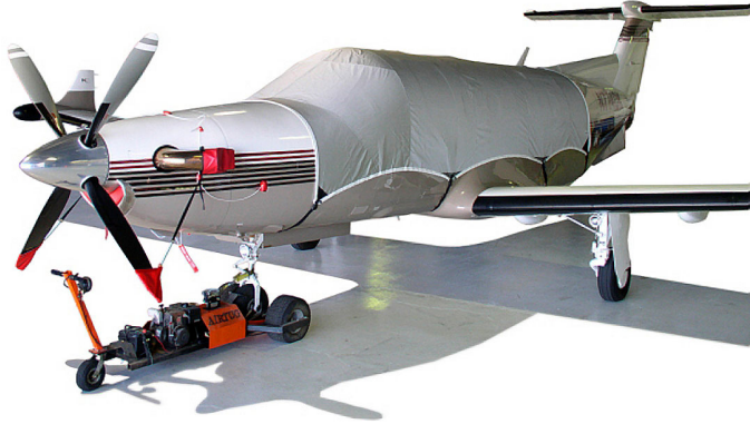
PC-12 Canopy Cover, Engine Plugs, Prop Tie/Exhaust Covers