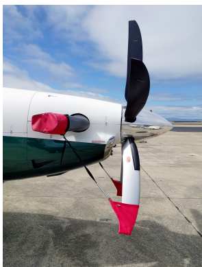
Pilatus PC-12 Prop Tie-Down/Exhaust Cover Set, 5 Blade

This cover type is made from Silver Acrylic Sunbrella canvas and is 100% lined with a soft and smooth microfiber. Bruce's Custom Covers developed this material combination especially for aircraft protection. The outer material is medium weight and treated for water resistance, UV resistance and anti-static buildup. The inner lining is a very soft and smooth microfiber to prevent scratching. The material is very reflective, and tests show that the cabin interior temperature can be reduced to near-ambient temperature on the hottest of days. It is water, ice and snow repellent, yet breathable to allow moisture to escape from between the cover and the aircraft surface.