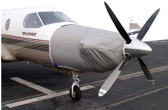
Pilatus PC-12 Engine Cover