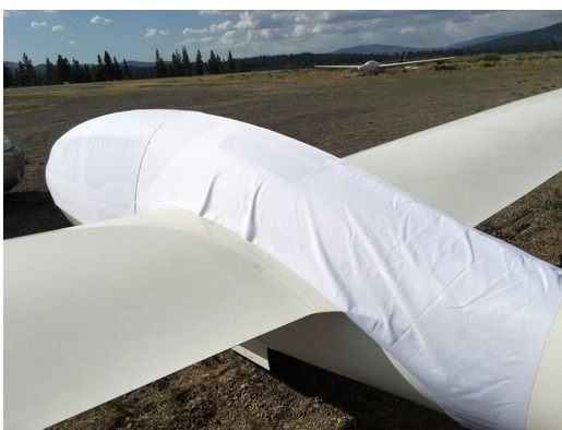
DG-1000 Canopy/Nose Cover, test fit cover