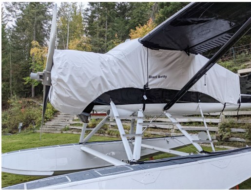
Beaver DHC2 MK1 Canopy/Engine Cover