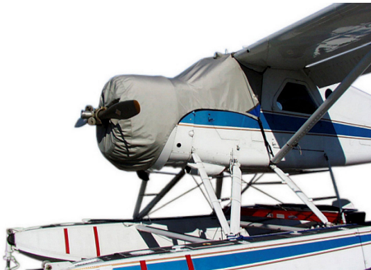
Beaver Windshield/Engine Cover

Travel Covers are made with Silver Solution-Dyed Polyester fabric and only lined over the windshield to save weight. The material is lightweight and more compact for easy stowage in the aircraft. The polyester material is water resistant, but only intended for occasional use outside. We also have an ultra lightweight material available for fitted hangar dust covers. For daily outdoor use, the non-travel Sunbrella Cover is the best choice.