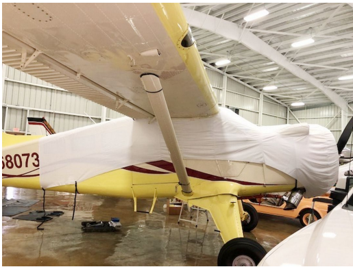
De Havilland Beaver Canopy/Engine Cover, test fit cover

This cover type is made from Silver Acrylic Sunbrella canvas and is 100% lined with a soft and smooth microfiber. Bruce's Custom Covers developed this material combination especially for aircraft protection. The outer material is medium weight and treated for water resistance, UV resistance and anti-static buildup. The inner lining is a very soft and smooth microfiber to prevent scratching. The material is very reflective, and tests show that the cabin interior temperature can be reduced to near-ambient temperature on the hottest of days. It is water, ice and snow repellent, yet breathable to allow moisture to escape from between the cover and the aircraft surface.