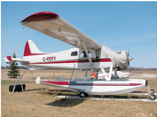
Beaver Windshield/Engine Cover