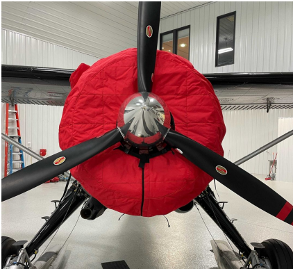
DeHavilland Beaver Insulated Engine Cover