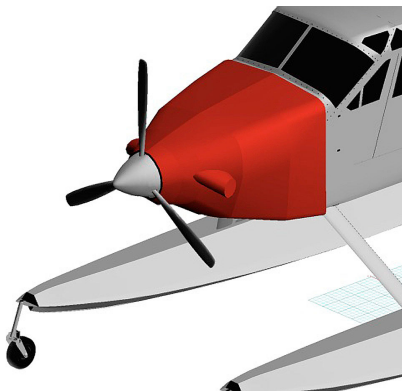
Turbo Beaver Insulated Engine Cover, 3D model