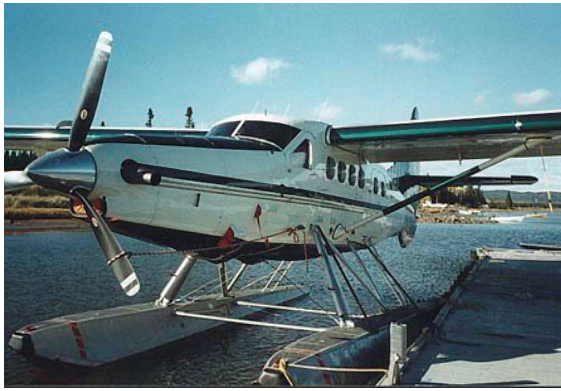
Covers & Plugs for the Turbine Otter