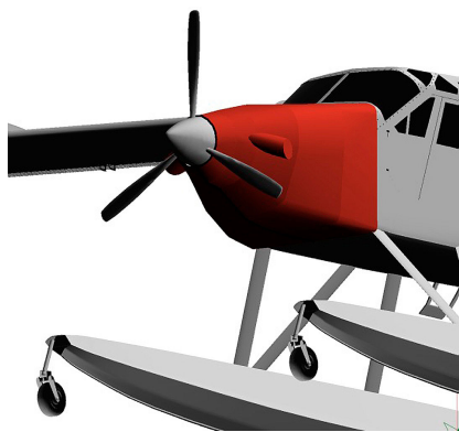
Turbo Beaver Insulated Engine Cover, 3D model

The material is very reflective, and tests show that the cabin interior temperature can be reduced to near-ambient temperature on the hottest of days. It is water, ice and snow repellent, yet breathable to allow moisture to escape from between the cover and the aircraft surface.