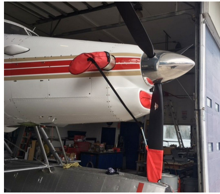
DeHavilland Turbin Otter Intake plugs, Prop Tie/Exhaust Covers