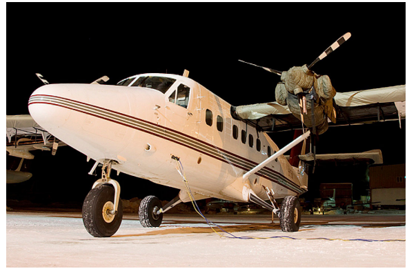
Twin Otter Wing, Horiz. Stab & Engine Covers