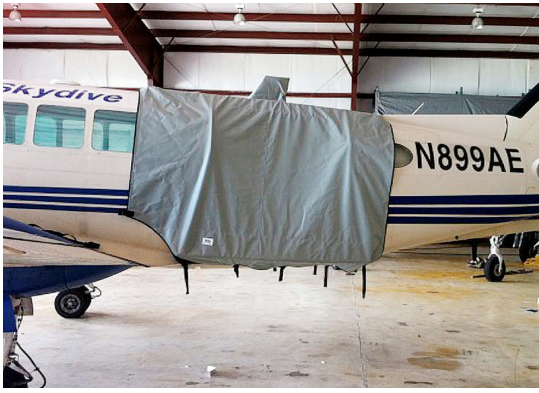
750XL Jump Door Cover