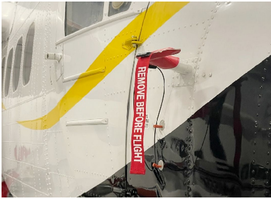
DeHavilland DH-6 Pitot Cover with Static Port Plugs