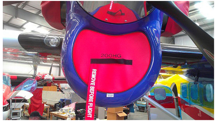
De Havilland Twin Otter Engine Inlet Plug and Exhaust Covers