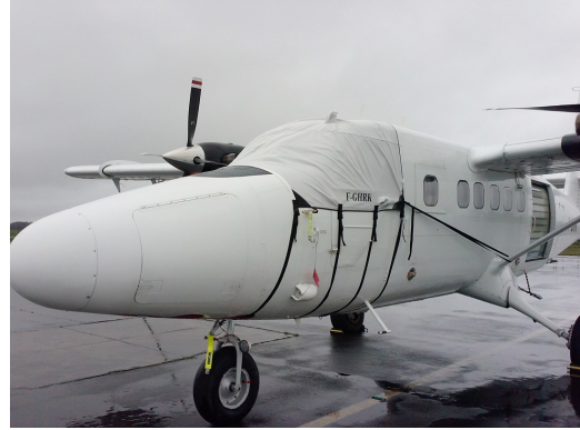
Twin Otter Cockpit Cover