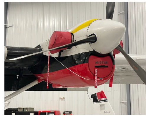
DeHavilland Twin Otter DHC6 Pitot Covers with Static Port Plugs