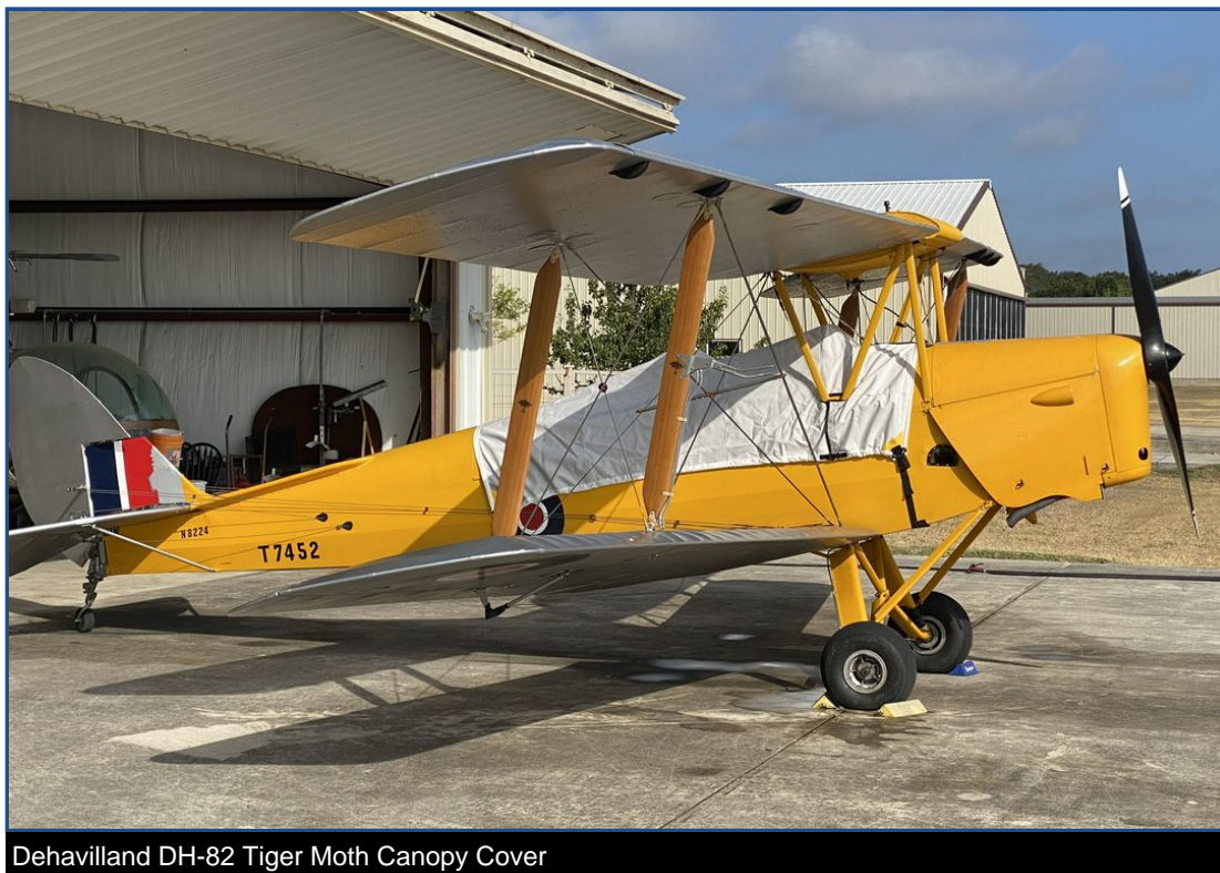
Dehavilland DH-82 Tiger Moth Canopy Cover