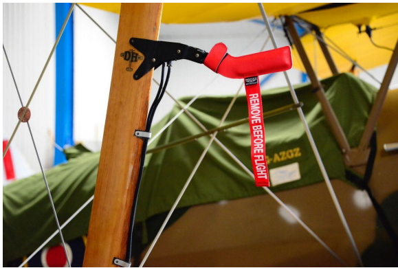
DeHavilland DH-82 Tiger Moth Pitot Cover

DeHavilland DH-82 Tiger Moth Pitot Tube Covers , NOT HEAT RESISTANT TYPE, are made of Naugahyde vinyl, and are designed to cover the entire pitot assembly. Slipping over the tube, the cover tightens around the base with a Velcro strap detail. A "Remove Before Flight" streamer is attached to the cover. Heat Resistant Pitot Covers are an upgrade to this design, and help prevent the pitot cover from melting onto the tube if the pitot heat is accidentally turned on while installed. If you want the set tethered together, please let us know.