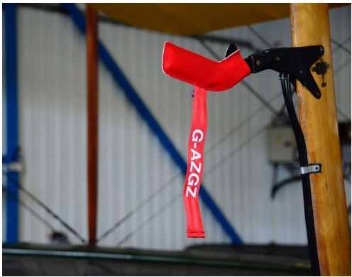
DeHavilland DH-82 Tiger Moth Pitot Cover