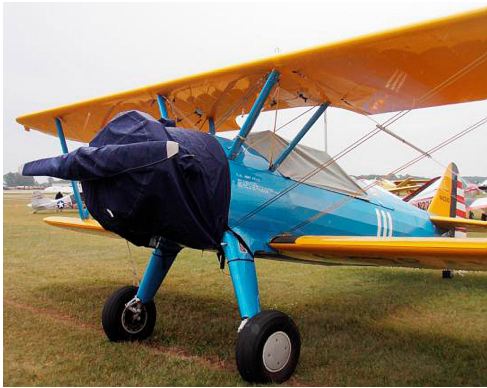
Stearman PT-13 Engine Cover