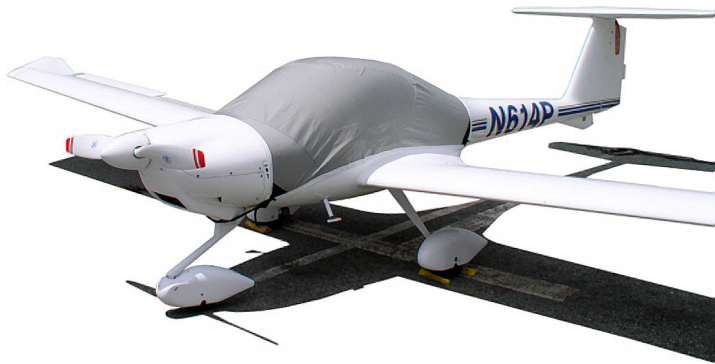
Diamond DA-20 Canopy Cover