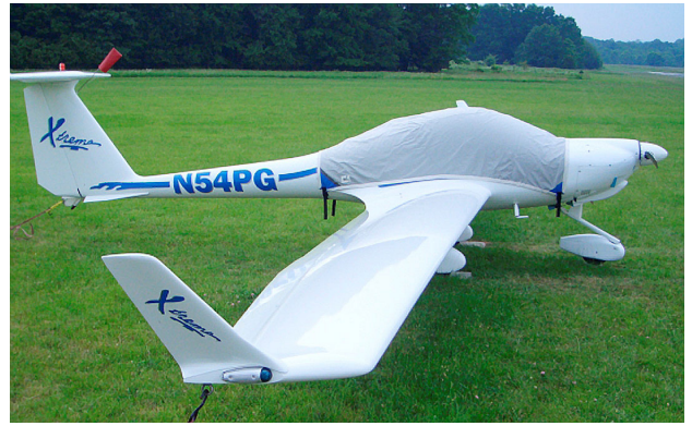
Dimona Xtreme Canopy Cover