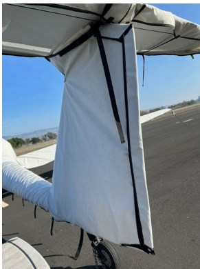
Dimona HK-36 Empennage Cover Set

WINTER USE MATERIAL - Made with Solution-Dyed Polyester fabric, this option is intended for seasonal use to aid in deicing, rain mitigation, or for occasional travel. The material is lighter and more compact, but more susceptible to UV damage and may have a shorter useful life if used continuously outside than the all-year use material.