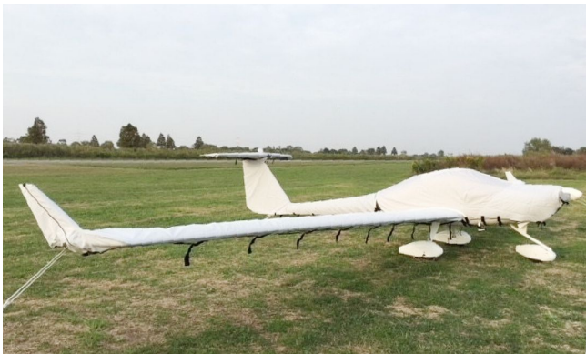
Diamond Super Dimona Cover Set

The Diamond HK-36, Super Dimona & Extreme Canopy/Engine Cover is a one-piece cover (100% lined with microfiber) that is a combination of the Canopy Cover and Engine Cover. This cover will enclose the engine cowl and will extend aft to cover all of the windows. This cover type is made from Silver Acrylic Sunbrella canvas and is 100% lined with a soft and smooth microfiber. Bruce's Custom Covers developed this material combination especially for aircraft protection. The outer material is medium weight and treated for water resistance, UV resistance and anti-static buildup. The inner lining is a very soft and smooth microfiber to prevent scratching. The material is very reflective, and tests show that the cabin interior temperature can be reduced to near-ambient temperature on the hottest of days. It is water, ice and snow repellent, yet breathable to allow moisture to escape from between the cover and the aircraft surface.