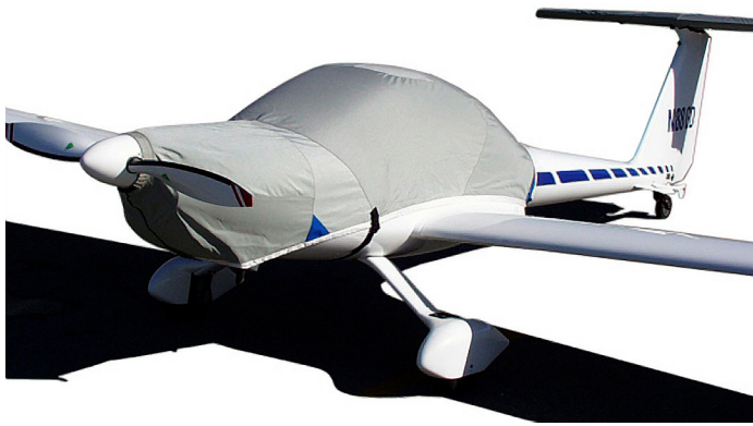
Diamond DA-20 Canopy/Engine Cover