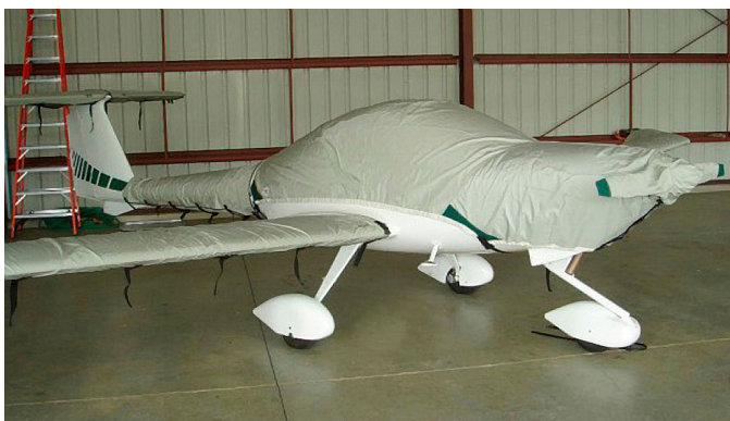
DA-20 Canopy/Engine, Prop/Spinner, Wing, Tailboom, Horiz. Stab. Covers

This cover type is made from Silver Acrylic Sunbrella canvas and is 100% lined with a soft and smooth microfiber. Bruce's Custom Covers developed this material combination especially for aircraft protection. The outer material is medium weight and treated for water resistance, UV resistance and anti-static buildup. The inner lining is a very soft and smooth microfiber to prevent scratching. The material is very reflective, and tests show that the cabin interior temperature can be reduced to near-ambient temperature on the hottest of days. It is water, ice and snow repellent, yet breathable to allow moisture to escape from between the cover and the aircraft surface.