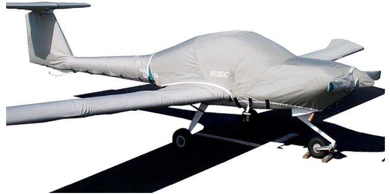
Dimona/Diamond HK36 Extreme Canopy/Engine, Wing Covers