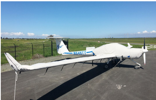
Dimona/Diamond HK36 Extreme Canopy/Engine, Wing Covers

WINTER USE MATERIAL - Made with Solution-Dyed Polyester fabric, this option is intended for seasonal use to aid in deicing, rain mitigation, or for occasional travel. The material is lighter and more compact, but more susceptible to UV damage and may have a shorter useful life if used continuously outside than the all-year use material.