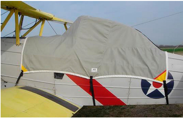
Grumman Ag Cat Canopy Cover