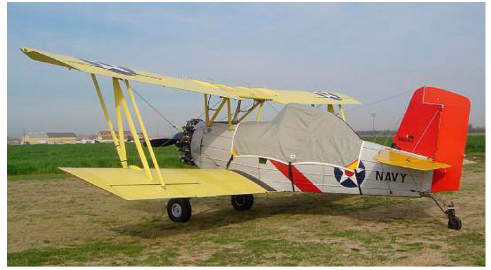
Grumman Ag Cat Canopy Cover