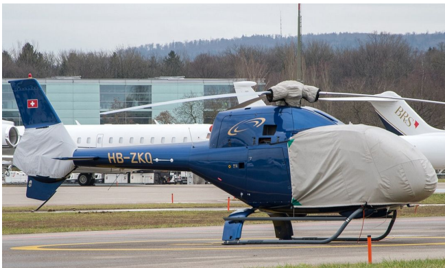
Eurocopter EC-120 Bubble, Rotor Mast & Tailfan Covers

The Tailboom Cover details vary by model, but generally the helicopter tail boom cover encloses the tail boom from the "bottleneck" to the aft end. They usually also cover the horizontal stabilizers, and are custom made to allow for antennae, lights, and other protrusions. They attach with straps underneath the tail boom. Covers for the vertical and horizontal stabilizers are also available separately. Specific information for each model is available on request.