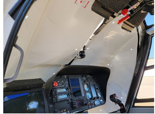
Eurocopter EC-120 Windshield HeatShields