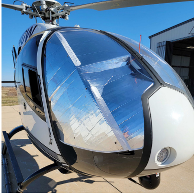
Eurocopter EC-120 Windshield HeatShields

Heatshields are interior sunshades for an aircraft's windows or canopy glass. The product is a unique composite of closed-cell foam with a silver mylar finish. The semi-rigid design is stiff enough to stand along the inside of the windshield using sun visors or window framing. It folds up flat and easily stores in the included storage sleeve. Some designs may require velcro and suction cups. A Heatshield is an excellent short-term remedy for cockpit overheating.