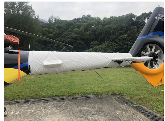
Eurocopter EC-120B Tailboom Cover