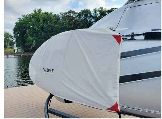
Eurocopter E120 Bubble Cover