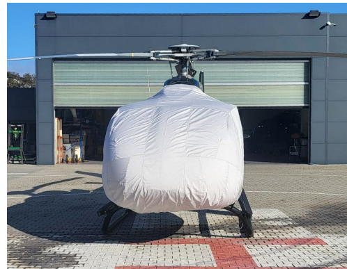
Airbus Helicopter H-130 Bubble Cover, Extends To Cover Fwd Engine Inlet