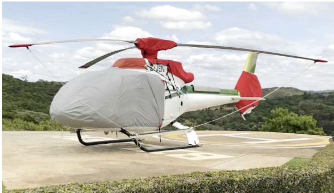
EC130 Bubble, Intake, Exhaust, Rotor Hub & Tailfan Covers

circulation and drainage in freezing weather. Some part numbers have features for an extra charge.