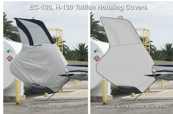
Airbus Helicopter H-130 Tailfan Housing Covers