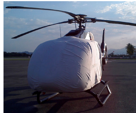
Bubble Cover and Intake/Exhaust Cover