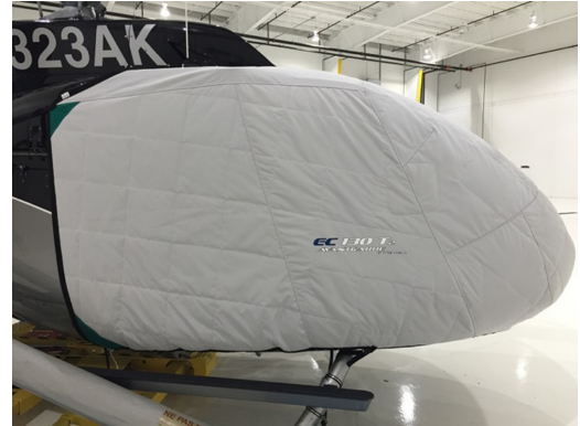
EC-130 Insulated Bubble Cover