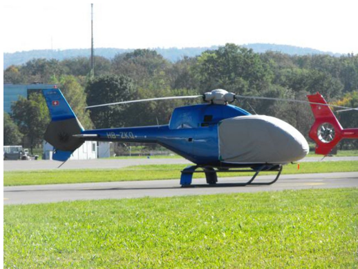
EC-130 Bubble, Tailfan, and Rotor Hub Cover

This cover type is made from Silver Acrylic Sunbrella canvas and is 100% lined with a soft and smooth microfiber. Bruce's Custom Covers developed this material combination especially for aircraft protection. The outer material is medium weight and treated for water resistance, UV resistance and anti-static buildup. The inner lining is a very soft and smooth microfiber to prevent scratching. The material is very reflective, and tests show that the cabin interior temperature can be reduced to near-ambient temperature on the hottest of days. It is water, ice and snow repellent, yet breathable to allow moisture to escape from between the cover and the aircraft surface.