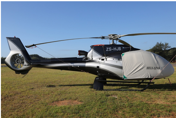
EC-130 Bubble Cover

This cover type is made from Silver Acrylic Sunbrella canvas and is 100% lined with a soft and smooth microfiber. Bruce's Custom Covers developed this material combination especially for aircraft protection. The outer material is medium weight and treated for water resistance, UV resistance and anti-static buildup. The inner lining is a very soft and smooth microfiber to prevent scratching. The material is very reflective, and tests show that the cabin interior temperature can be reduced to near-ambient temperature on the hottest of days. It is water, ice and snow repellent, yet breathable to allow moisture to escape from between the cover and the aircraft surface.