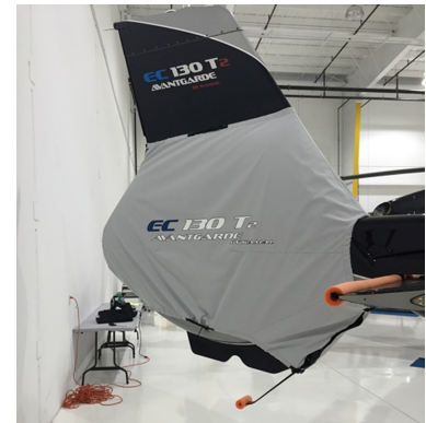
EC-130 Tailfan Cover