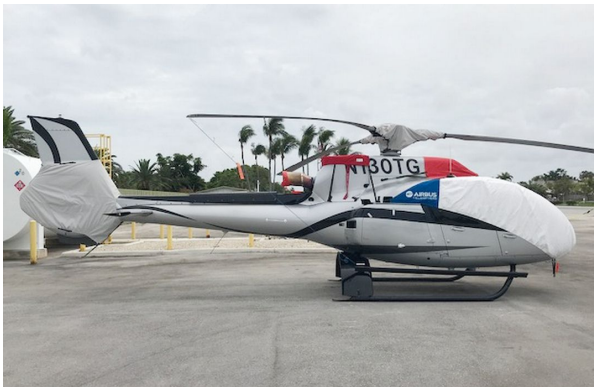
AIRBUS H130 T2, Intake, Exhaust & Tailfan Covers

The Tailboom Cover details vary by model, but generally the helicopter tail boom cover encloses the tail boom from the "bottleneck" to the aft end. They usually also cover the horizontal stabilizers, and are custom made to allow for antennae, lights, and other protrusions. They attach with straps underneath the tail boom. Covers for the vertical and horizontal stabilizers are also available separately. Specific information for each model is available on request.