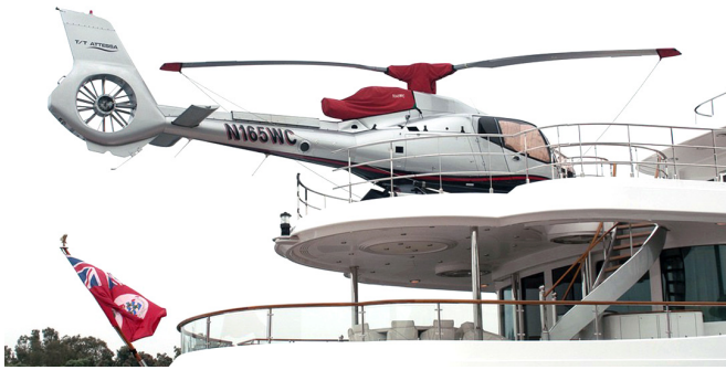
Intake/Exhaust Cover, Rotor Hub Cover (w/ skirt) & Blade Tie Downs

tight at the blade root with straps and quick-release plastic buckles. The Cold Weather Blade Covers are fitted with full-length zippers and optional deice “boots” designed to accept a preheater hose; a small opening at the tip of the cover allows for some air circulation and drainage in freezing weather. Some part numbers have features for an extra charge.