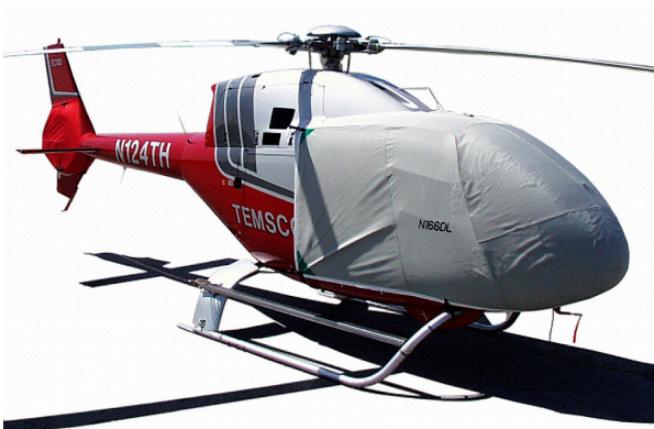
Eurocopter EC-120 Bubble Cover & Tailfan Cover