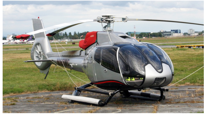
Intake/Exhaust Cover, Rotor Hub Cover (w/ skirt) & Blade Tie Downs