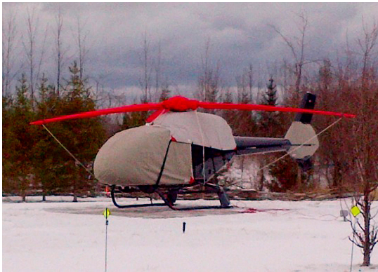
EC-130 Bubble, Engine, Rotor Hub, Blade & Tailfan Covers