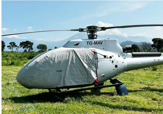
Airbus H-130 Insulated Bubble Cover

This cover type is made from Silver Acrylic Sunbrella canvas and is 100% lined with a soft and smooth microfiber. Bruce's Custom Covers developed this material combination especially for aircraft protection. The outer material is medium weight and treated for water resistance, UV resistance and anti-static buildup. The inner lining is a very soft and smooth microfiber to prevent scratching. The material is very reflective, and tests show that the cabin interior temperature can be reduced to near-ambient temperature on the hottest of days. It is water, ice and snow repellent, yet breathable to allow moisture to escape from between the cover and the aircraft surface.