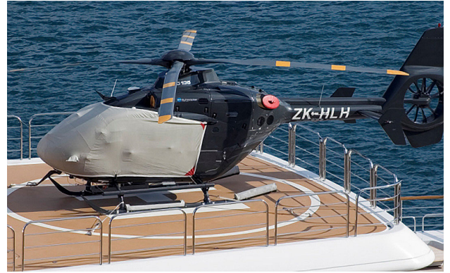
EC-135 Bubble Cover & Exhaust Plugs