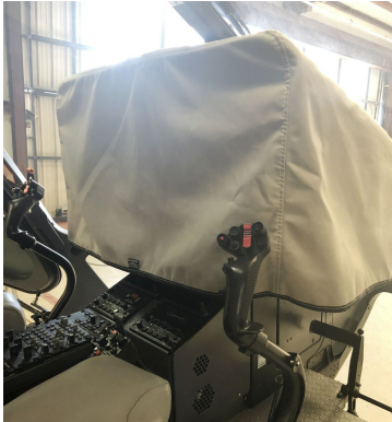
Eurocopter EC-135 Instrument Panel Heatshield Cover

Heatshields are interior sunshades for an aircraft's windows or canopy glass. The product is a unique composite of closed-cell foam with a silver mylar finish. The semi-rigid design is stiff enough to stand along the inside of the windshield using sun visors or window framing. It folds up flat and easily stores in the included storage sleeve. Some designs may require velcro and suction cups. A Heatshield is an excellent short-term remedy for cockpit overheating.