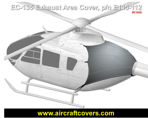
EC135 Exhaust Area Cover, illustration