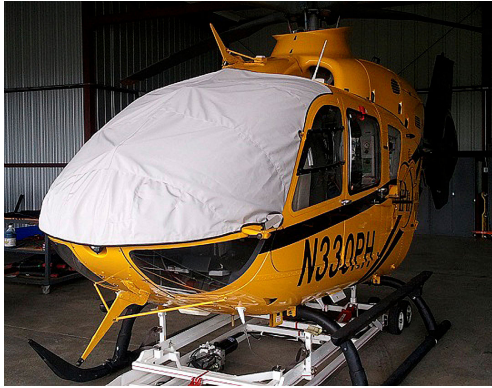
EC-135 Windshield/Skylights Cover, pinches in door jambs

This cover type is made from Silver Acrylic Sunbrella canvas and is 100% lined with a soft and smooth microfiber. Bruce's Custom Covers developed this material combination especially for aircraft protection. The outer material is medium weight and treated for water resistance, UV resistance and anti-static buildup. The inner lining is a very soft and smooth microfiber to prevent scratching. The material is very reflective, and tests show that the cabin interior temperature can be reduced to near-ambient temperature on the hottest of days. It is water, ice and snow repellent, yet breathable to allow moisture to escape from between the cover and the aircraft surface.