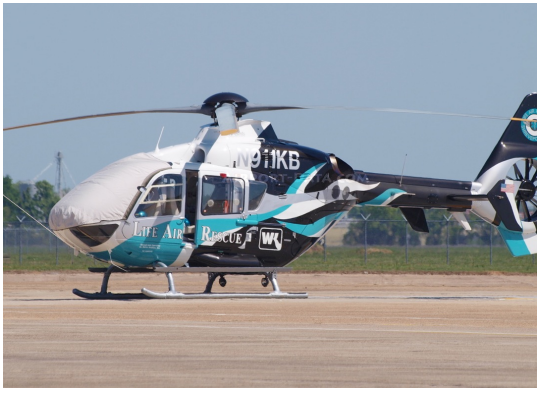
Eurocopter EC-135 Windshield/Skylight Cover