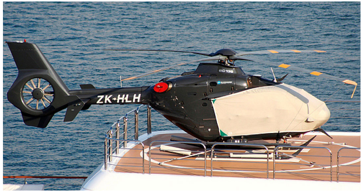
EC-135 Bubble Cover & Exhaust Plugs