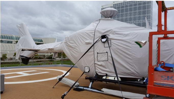
EC-135 Full Cover Set

The Tailboom Cover details vary by model, but generally the helicopter tail boom cover encloses the tail boom from the "bottleneck" to the aft end. They usually also cover the horizontal stabilizers, and are custom made to allow for antennae, lights, and other protrusions. They attach with straps underneath the tail boom. Covers for the vertical and horizontal stabilizers are also available separately. Specific information for each model is available on request.