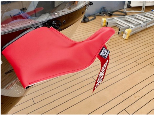
Airbus Helicopter H145 Pitot Tube Cover