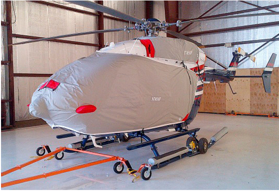
Bubble Cover w/ nose mounted radome & Upper Deck Plugs/Cover

This cover type is made from Silver Acrylic Sunbrella canvas and is 100% lined with a soft and smooth microfiber. Bruce's Custom Covers developed this material combination especially for aircraft protection. The outer material is medium weight and treated for water resistance, UV resistance and anti-static buildup. The inner lining is a very soft and smooth microfiber to prevent scratching. The material is very reflective, and tests show that the cabin interior temperature can be reduced to near-ambient temperature on the hottest of days. It is water, ice and snow repellent, yet breathable to allow moisture to escape from between the cover and the aircraft surface.