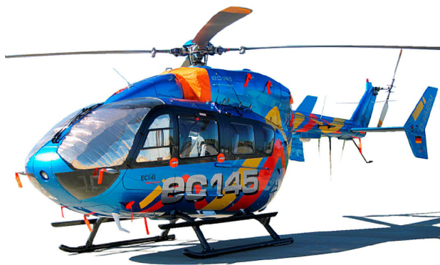
EC-145 Cabin Heatshield Set

Heatshields are interior sunshades for an aircraft's windows or canopy glass. The product is a unique composite of closed-cell foam with a silver mylar finish. The semi-rigid design is stiff enough to stand along the inside of the windshield using sun visors or window framing. It folds up flat and easily stores in the included storage sleeve. Some designs may require velcro and suction cups. A Heatshield is an excellent short-term remedy for cockpit overheating.