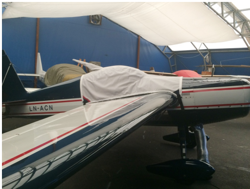
Extra 200 Canopy Cover

This cover type is made from Silver Acrylic Sunbrella canvas and is 100% lined with a soft and smooth microfiber. Bruce's Custom Covers developed this material combination especially for aircraft protection. The outer material is medium weight and treated for water resistance, UV resistance and anti-static buildup. The inner lining is a very soft and smooth microfiber to prevent scratching. The material is very reflective, and tests show that the cabin interior temperature can be reduced to near-ambient temperature on the hottest of days. It is water, ice and snow repellent, yet breathable to allow moisture to escape from between the cover and the aircraft surface.