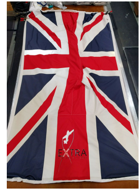
Custom Full-Cover Artwork