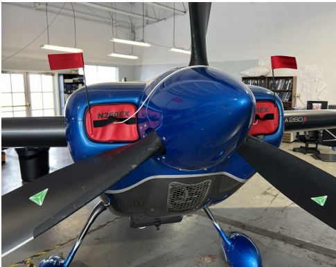
Extra 260 Engine Inlet Plugs

Engine Inlet Plugs are custom fit for your Extra 300, 330SC, 330SX & 200/230 Models intakes, made with heavy-duty vinyl material, and stuffed with a single block of sculpted urethane foam. Each plug has a zipper that allows the foam to be removed and dried if necessary. Engine plugs have warning flags that are visible from the cockpit or 'remove before flight' streamers sewn onto the face of the plugs. Most plugs are imprinted with the aircraft registration number in black for an extra charge. Storage bag NOT included. Engine plugs may be inserted after flight when the engine is still warm. Engine Inlet Plugs are commonly referred to as Cowl Plugs, Intake Plugs, Cowl Blocks, Engine Blocks, and Engine Bungs.