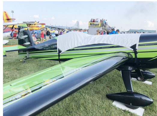
Extra 330 Canopy Cover