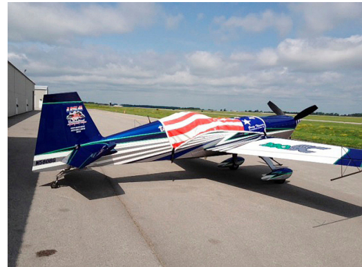
Extra 300SC Canopy Cover with custom artwork