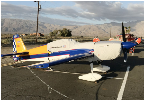
Extra 300S Canopy & Engine Covers