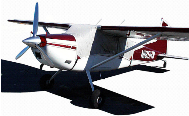
Cessna 185 Over-the-Top Canopy Cover

This cover type is made from Silver Acrylic Sunbrella canvas and is 100% lined with a soft and smooth microfiber. Bruce's Custom Covers developed this material combination especially for aircraft protection. The outer material is medium weight and treated for water resistance, UV resistance and anti-static buildup. The inner lining is a very soft and smooth microfiber to prevent scratching. The material is very reflective, and tests show that the cabin interior temperature can be reduced to near-ambient temperature on the hottest of days. It is water, ice and snow repellent, yet breathable to allow moisture to escape from between the cover and the aircraft surface.