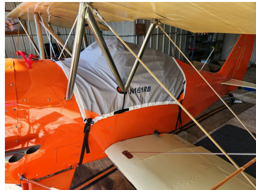
Burt Special Canopy Cover