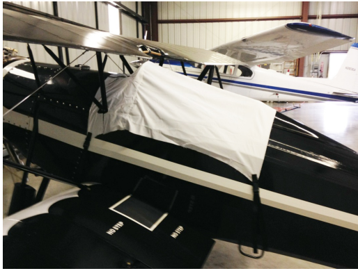
Rose Parrakeet Canopy Cover (test fit cover)

the hottest of days. It is water, ice and snow repellent, yet breathable to allow moisture to escape from between the cover and the aircraft surface.