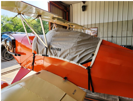
Burt Special Canopy Cover

This cover type is made from Silver Acrylic Sunbrella canvas and is 100% lined with a soft and smooth microfiber. Bruce's Custom Covers developed this material combination especially for aircraft protection. The outer material is medium weight and treated for water resistance, UV resistance and anti-static buildup. The inner lining is a very soft and smooth microfiber to prevent scratching. The material is very reflective, and tests show that the cabin interior temperature can be reduced to near-ambient temperature on the hottest of days. It is water, ice and snow repellent, yet breathable to allow moisture to escape from between the cover and the aircraft surface.