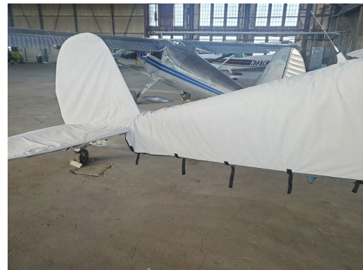
Cessna 140 Empennage Cover