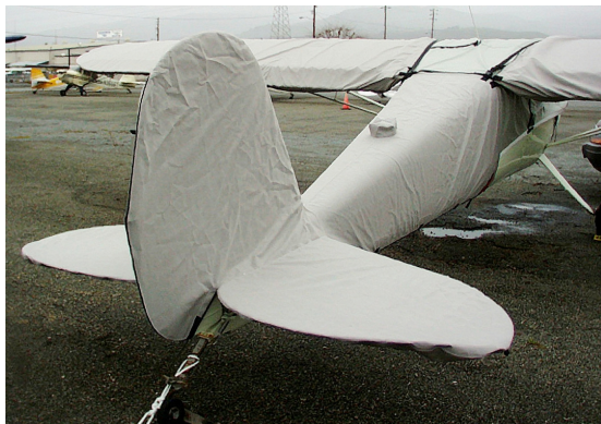
Cessna 120 Empennage Cover

WINTER USE MATERIAL - Made with Solution-Dyed Polyester fabric, this option is intended for seasonal use to aid in deicing, rain mitigation, or for occasional travel. The material is lighter and more compact, but more susceptible to UV damage and may have a shorter useful life if used continuously outside than the all-year use material.